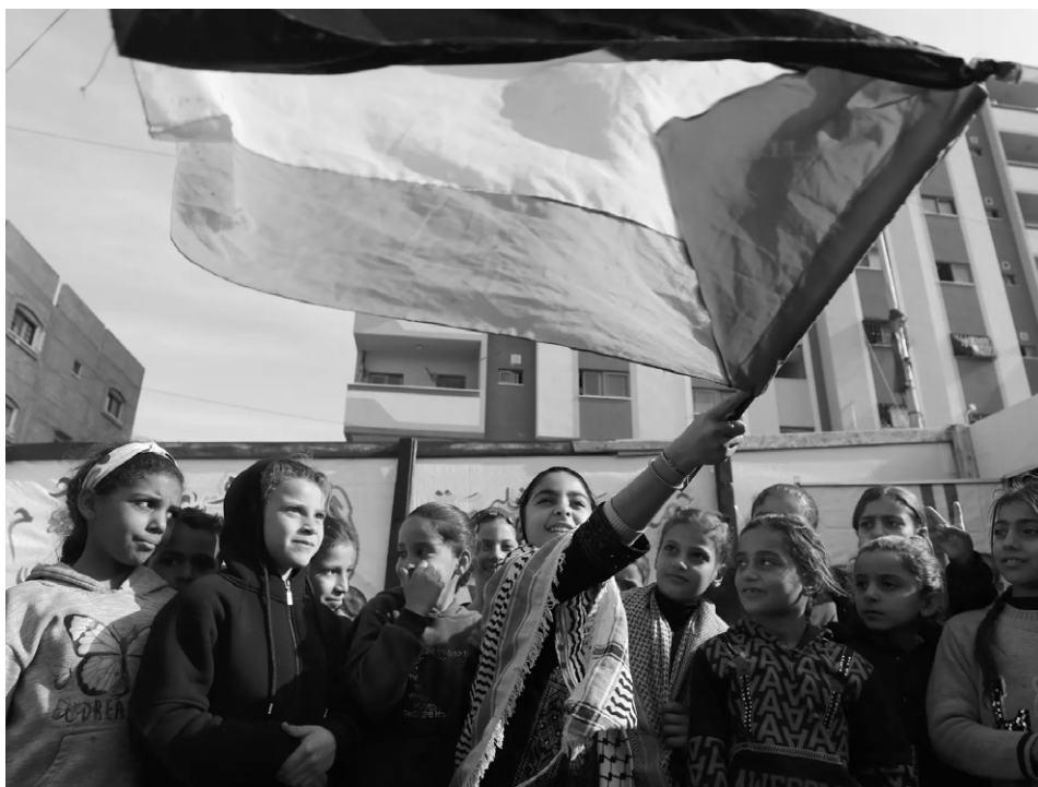
Palestinians celebrate ceasefire in Gaza.

Despite enormous hardship and even facing famine, the people of Gaza have refused to be expelled to the south. In resistance, in guerrilla