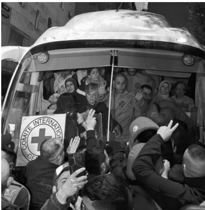
Palestinian women hostages released, Jan. 19, 2025.

Prime Minister Benjamin Netanyahu and General Yoav Gallant remain two Israeli war criminals facing charges at the International Criminal Court. The journalists who confronted the outgoing U.S. Secretary of State Antony Blinken at his