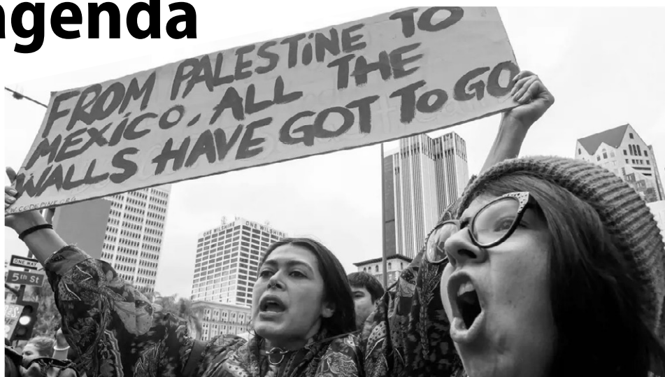
Mass protests pushed back against anti-migrant policies during the first Trump administration. Feb, 22, 2017, Los Angeles.

The hate-monger Trump took his oath of office with his hand on – not one, but two – Bibles, his late mother's and the one President Abraham Lincoln purportedly used in his inauguration. References to the biblical god permeated the entire ceremony, from the invocation by Rev.