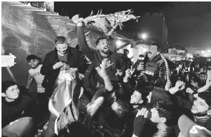
Los palestinos celebran el alto el fuego en Khan Younis, sur de Gaza, 15 de enero de 2025.

Tras 15 meses de destrucción despiadada, financiada por Estados Unidos, por parte de las Fuerzas de Ocupación de Israel de todas las ciudades, incluidos todos los hospitales, escuelas, incendiando tiendas de campaña y más de 64.000 muertes oficiales en Gaza, el Movimiento de Resistencia Islámica Hamás, en consulta con representantes de las demás facciones palestinas, anunció el 15 de enero que se había alcanzado un