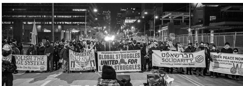
Martin Luther King Day counter-inaugural march, Philadelphia, Jan. 20, 2025. Read roundup online.