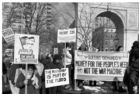
New York City march, Jan. 20, 2025.