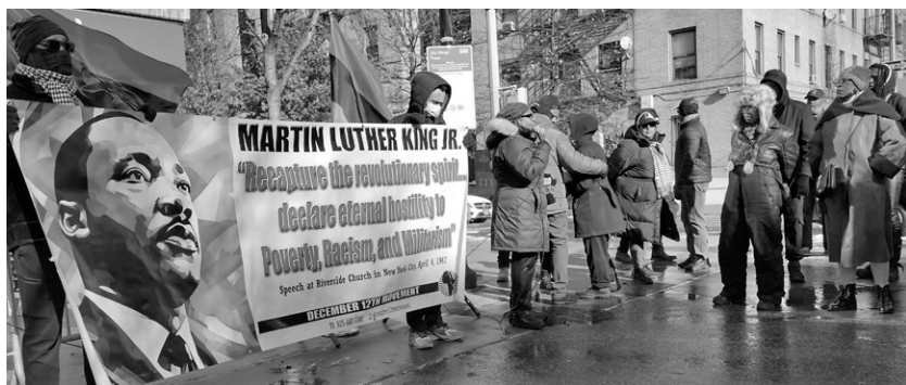
March called by December 12 Movement, Brooklyn, New York, Jan. 20, 2025.