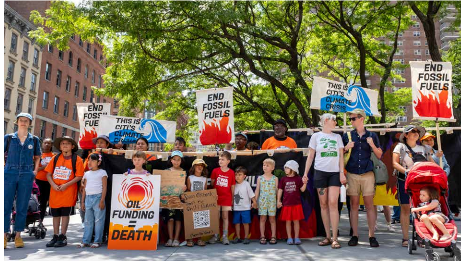
Protest at Citibank's Manhattan headquarters and CEO Jane Fraser's home on July 27, 2024, to highlight children displaced by climate change.

global warming drew the winds formed over the Mojave Desert through the mountain passes leading to LA, heating the winds and speeding them up. There were wind gusts in the San Gabriel Mountains of 100 miles per hour. These winds fed oxygen to the blazes and pushed their flames before the wind. The smallest fire rapidly grew, almost explosively, and the high winds spread embers for miles.