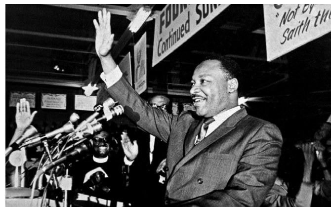
Rev. Dr. Martin Luther King Jr., Memphis, Tenn., March 28, 1968

Amazon warehouse workers and drivers began their recent historic, coordinated strike at facilities Dec. 19 in four California cities; Atlanta; Chicago; and Queens, New York. At midnight on Dec. 21, they were joined by members of the Amazon Labor Union at the JFK8 warehouse in Staten Island, New York, where the ALU won the first union election at Amazon in the U.S. in April 2022. JFK8 workers maintained a 24-hour picket line even as the temperature dropped to 13 degrees Fahrenheit.