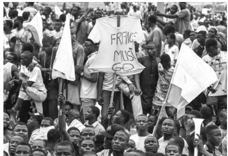
Protesters in Niamey, Niger, hold a T-shirt reading 'France Must Go' at September 2023 protest as they demand the departure of the French army.

France began its colonization of West Africa about 175 years ago, when Louis Faidherbe was appointed the colonial governor of Senegal. In the 1960s, France was forced, reluctantly, to grant formal independence to its colonies. These countries were seething with resentment and anger after decades of colonial exploitation, enforced by murder and massacres when the French government's control was slipping.