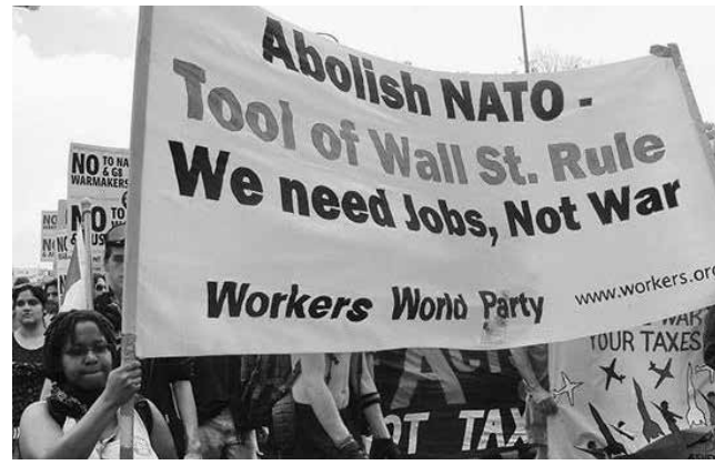
Chicago, mid-May 2012, during week of anti-NATO actions.

In a recent interview with Time magazine, Trump promised he would continue