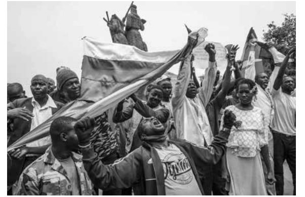
Anti-French demonstration, Bamako, Mali, 2024.

is hoping to add additional members. Significantly, the AES has recently created its own insignia that features a baobab tree, a very important tree in the Sahel.