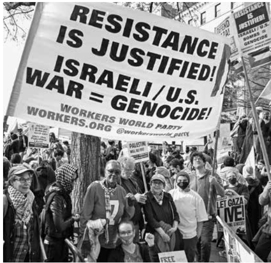
Washington, DC, Nov. 4, 2023.

Our articles explode the corporate media's "Big Lie" about the Zionist state's founding and expose the truth: Israel was created by U.S. and British-backed Zionist expulsion at gunpoint of 750,000 Indigenous Palestinians from their homes, farms and villages to live in refugee camps in Gaza or elsewhere.