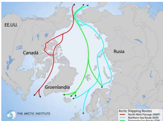
El mapa muestra la Ruta Marítima Septentrional (NSR), el Paso del Noroeste (NWP) y la Ruta Marítima Transpolar (TSR).

En el lago de agua dulce Gatún, esencial para el paso por