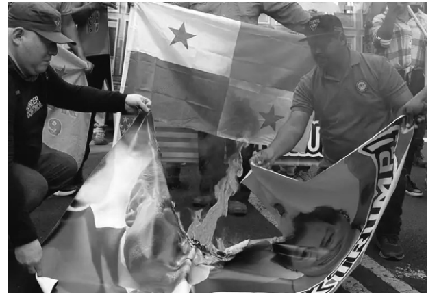
Protesters chanted anti-Trump slogans in front of the U.S. Embassy in Panama, Dec. 24, 2024.

Trump's new "America First" pronouncements also included a jab at Canadian Prime Minister Justin Trudeau.