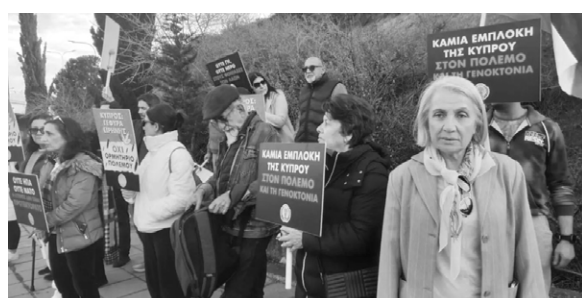
Cyprus Central Airport, Jan. 11.

People rallied at Cyprus Central Airport Jan. 11 to express outrage at the visit from Israeli President Isaac Herzog. They were protesting Israel's genocidal policies toward Palestine and Lebanon. Other