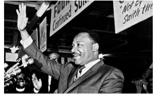
El reverendo Martin Luther King Jr.