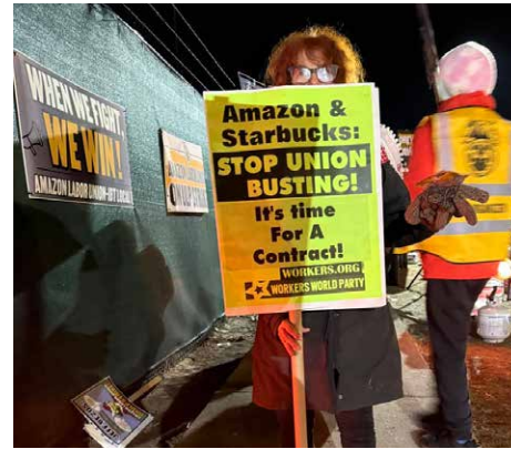
Huelga de Amazon, almacén JFK8 en Staten Island, Nueva York, 23 de diciembre de 2024.

a cabo la mayor huelga de Amazon en la historia laboral de Estados Unidos. El sindicato Teamsters (IBT), al que la ALU se afilió en junio, realizó más de 200 piquetes en solidaridad con la huelga.