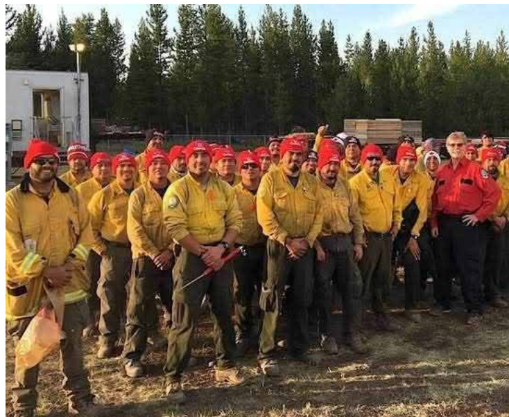
Mexican firefighters have come to help fight catastrophic fires in Los Angeles. See editorial, p. 6.