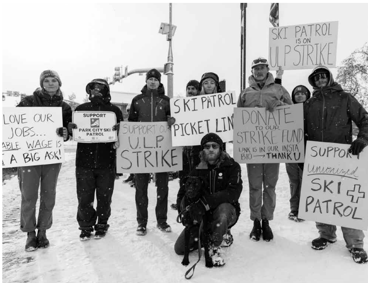
Ski patrol workers on strike in Park City, Colorado, December 2024.