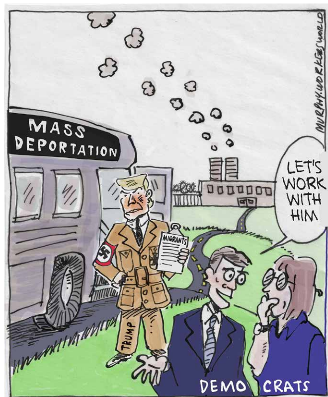
Migrant workers and their allies anticipate attacks from MAGA forces after the inauguration. The Democrats haven't helped much; they've often hurt migrant communities. Solidarity is needed. Undocumented workers have shown solidarity in the other direction, acting heroically during the Los Angeles inferno.

Our Telegram channel: t.me/WorkersWorldParty