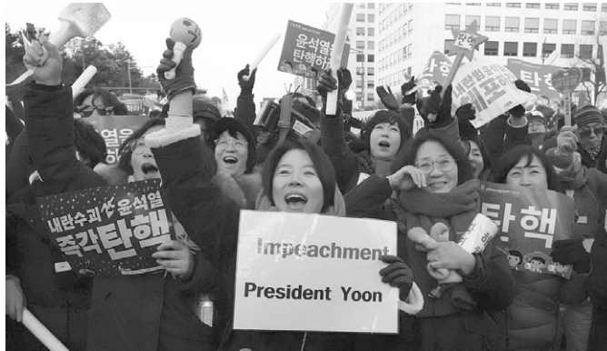
Massive protest by Korean Confederation of Trade Unions against Yoon in Seoul, Dec. 4, 2024.

South Korean politics has been plunged into chaos since Dec. 3, with several members of President Yoon's inner circle having resigned, and some have been detained by