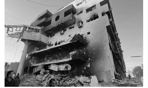
Israeli military destroys Al-Shifa hospital in Gaza in the spring of 2024, killing many patients.

The Lancet acknowledges that the Ministry of Health adequately reported on the number of deaths at the beginning of the war but didn't have the capacity to keep up with the rapidity of the death toll due to not only the destruction of hospitals but the ongoing disruption of