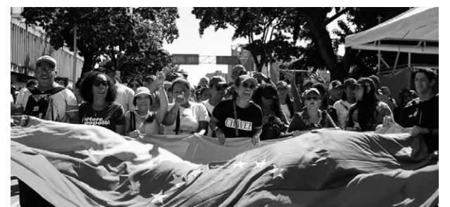
Venezuelans celebrate inauguration of reelected President Nicolás Maduro, Caracas, Jan. 10, 2025.

At the inauguration on Jan. 10, Maduro further emphasized the new initiative's break with the political and economic policies of the past, asking, "What does the oligarchy offer? To [bring Venezuela] back