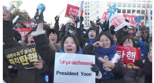
Massive protest by Korean Confederation of Trade Unions against Yoon in Seoul, South Korea, Dec. 4, 2024.

"When he became the President, he said he would turn this into the republic of prosecu-