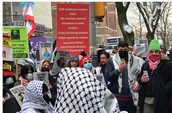
Solidarity with Gaza health care workers rally, New York City, Jan. 6, 2025.

They chanted "300,000 dead, NYU your hands are red!" and "NYU you will learn, refugees will return." The demonstration was called by Within Our Lifetime, Healthcare Workers for Palestine, and Doctors Against Genocide.