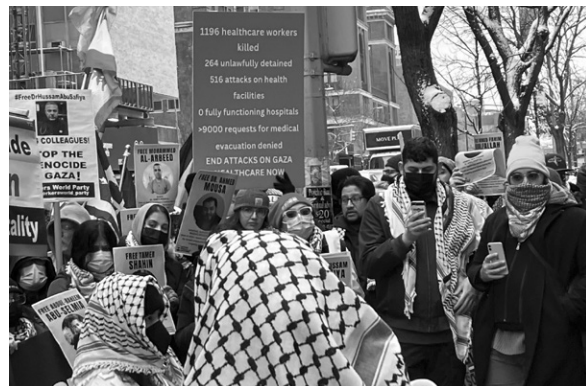
Solidarity with Gaza health care workers rally, New York City, Jan. 6, 2025.

They chanted “300,000 dead, NYU your hands are red!” and “NYU you will learn, refugees will return.” The demonstration was called by Within Our Lifetime, Healthcare Workers for Palestine, and Doctors Against Genocide.