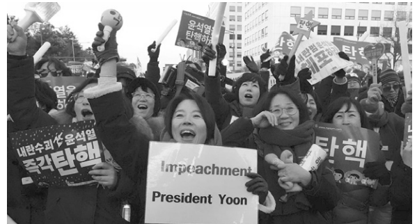
Massive protest by Korean Confederation of Trade Unions against Yoon in Seoul, South Korea, Dec. 4, 2024.

"When he became the President, he said he would turn this into the republic of prosecu-