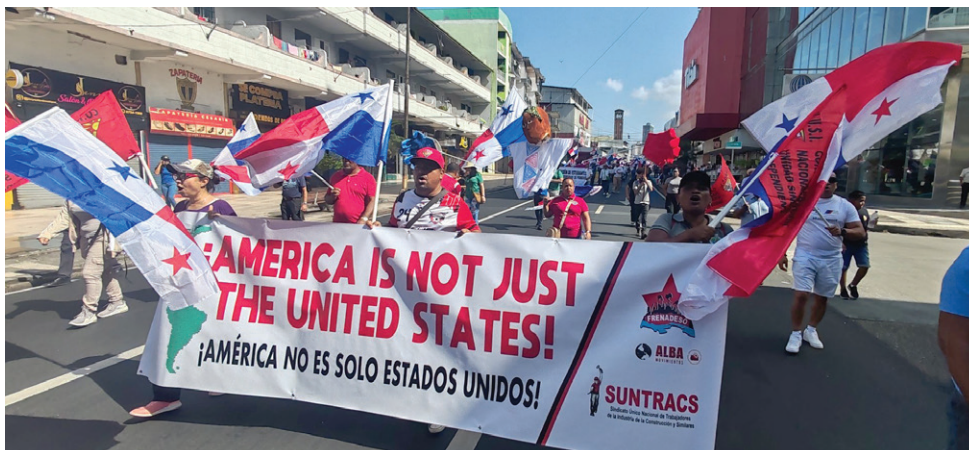
Panamá City, Feb. 2, 2025. Banner of union confederation SUNTRACS.

The National Assembly of Deputies, as an organ of the Panamanian State, cannot escape its responsibilities, and at this point it owes the Panamanian people a pronouncement in defense of national sovereignty in light of the insults of Trump and his lackeys, not at an individual level, nor with the excuse of holding other entities to account,