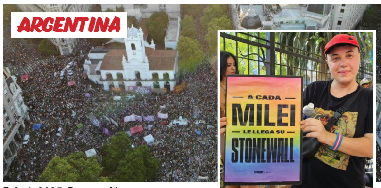
Feb. 1, 2025, Buenos Aires