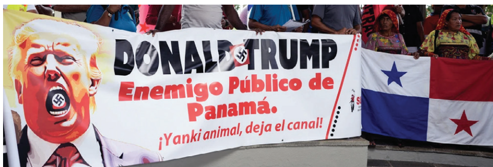
Panamá City, Dec. 31, 2024. 'Donald Trump – Public enemy of Panamá.'

For more background on the struggle for sovereignty regarding the canal, see workers.org/2025/01/83598/ .