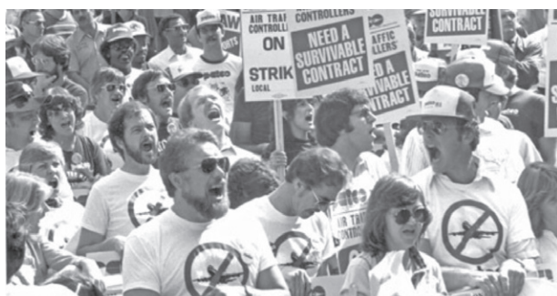
Striking members of the Professional Air Traffic Controllers Organization, who went on strike Aug. 3, 1981, and were fired two days later by then-President Ronald Reagan.

No one should be surprised any time Trump exposes himself as the vile, disgusting, ultraright-wing bigot that he is.