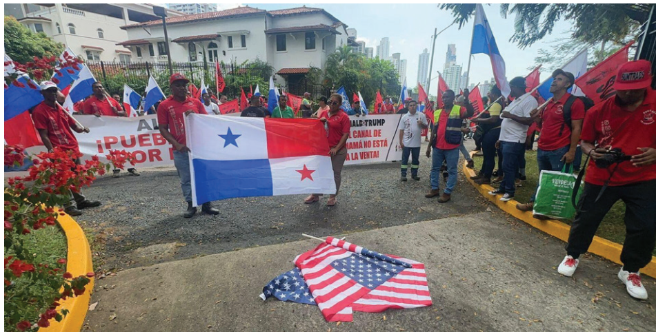
Ciudad de Panamá, el 2 de febrero de 2025. Manifestación en contra de la visita de Marco Rubio, el secretario de estado de los EE. UU.

Donald Trump está impulsado por sus ambiciones imperialistas, como cualquier