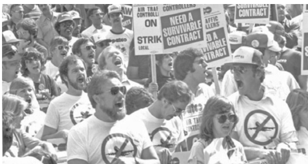
Striking members of the Professional Air Traffic Controllers Organization, who went on strike Aug. 3, 1981, and were fired two days later by then-President Ronald Reagan.

No one should be surprised any time Trump exposes himself as the vile, disgusting, ultraright-wing bigot that he is.