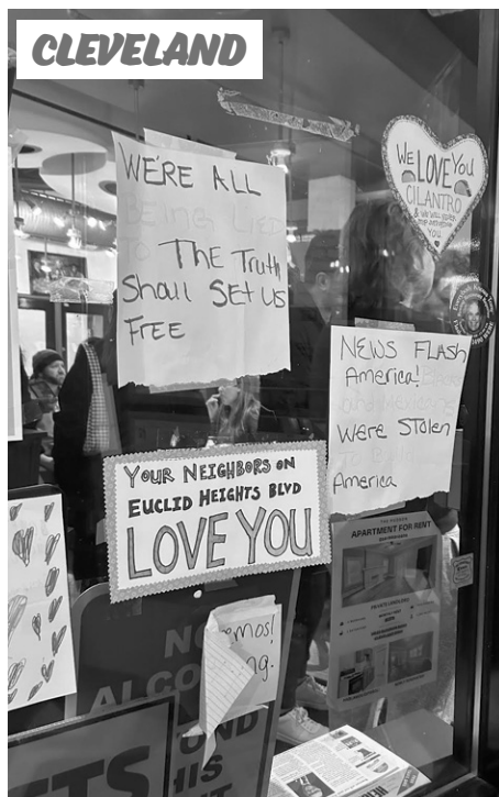
Feb. 1, 2025

Cilantro Taqueria in Cleveland Heights, Ohio, was especially crowded, even for a Saturday night, on Feb. 1. People came out to express solidarity and outrage over the arrest of six Cilantro workers by Immigration and Customs Enforcement agents on Jan. 26. The workers were taken to the ICE detention center in Geauga County, over 20 miles east of Cleveland Heights.