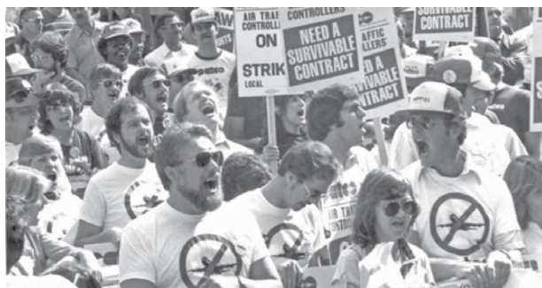
Miembros en huelga de la Organización Profesional de Controladores de Tráfico Aéreo (PATCO), que se declararon en huelga el 3 de agosto de 1981 y fueron despedidos dos días después por el entonces presidente Ronald Reagan.

Nadie debería sorprenderse cada vez que Trump se expone como el vil y repugnante intolerante ultraderechista que es.