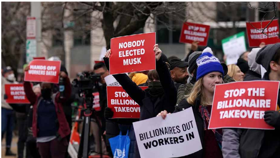
Federal workers protest job cuts, Feb. 5, 2025, Washington, D.C.

Abolishing USAID would also mean an end to programs that have saved lives, including food aid, AIDS/HIV prevention, disaster relief, bed nets that offer protection from malaria and demining programs in Vietnam — where unexploded ordnance continues to kill people 50 years after the Vietnam War’s end.