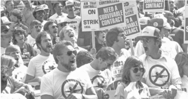
Miembros en huelga de la Organización Profesional de Controladores de Tráfico Aéreo (PATCO), que se declararon en huelga el 3 de agosto de 1981 y fueron despedidos dos días después por el entonces presidente Ronald Reagan.

Nadie debería sorprenderse cada vez que Trump se expone como el vil y repugnante intolerante ultraderechista que es.