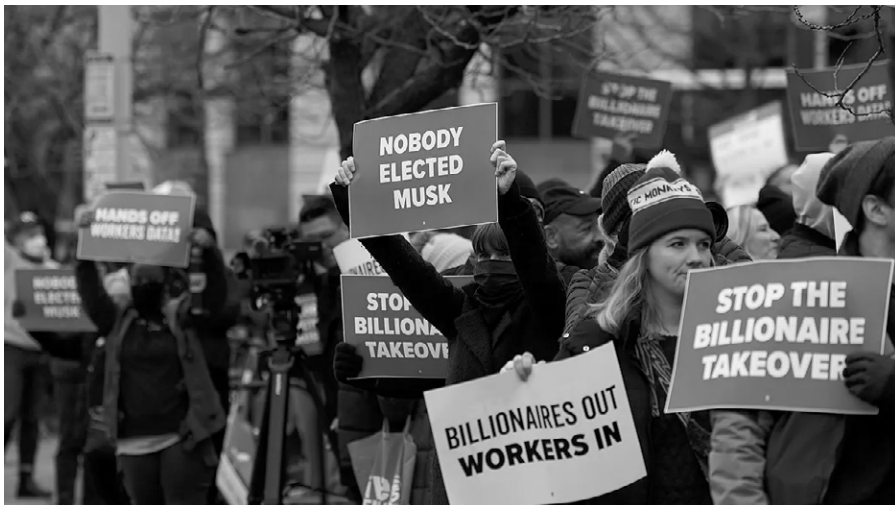
Federal workers protest job cuts, Feb. 5, 2025, Washington, D.C.

Abolishing USAID would also mean an end to programs that have saved lives, including food aid, AIDS/HIV prevention, disaster relief, bed nets that offer protection from malaria and demining programs in Vietnam — where unexploded ordnance continues to kill people 50 years after the Vietnam War’s end.