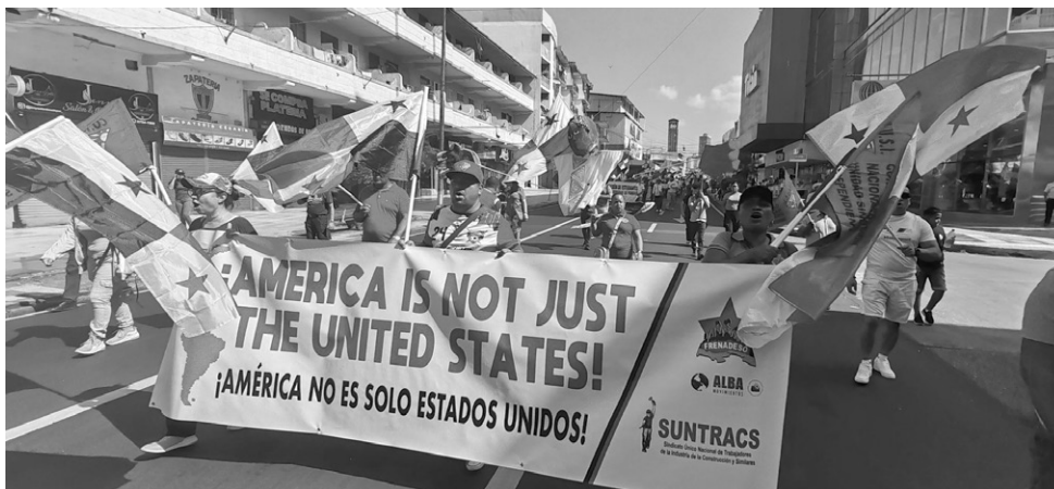
Panamá City, Feb. 2, 2025. Banner of union confederation SUNTRACS.

The National Assembly of Deputies, as an organ of the Panamanian State, cannot escape its responsibilities, and at this point it owes the Panamanian people a pronouncement in defense of national sovereignty in light of the insults of Trump and his lackeys, not at an individual level, nor with the excuse of holding other entities to account,