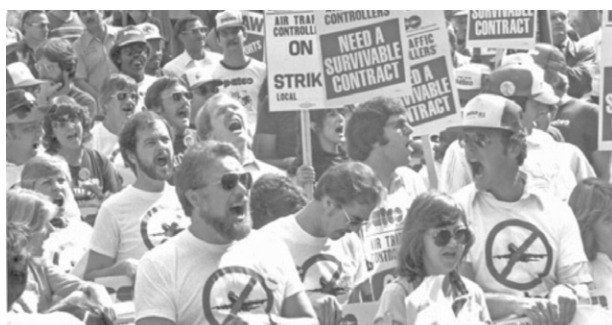
Striking members of the Professional Air Traffic Controllers Organization, who went on strike Aug. 3, 1981, and were fired two days later by then-President Ronald Reagan.

No one should be surprised any time Trump exposes himself as the vile, disgusting, ultraright-wing bigot that he is.