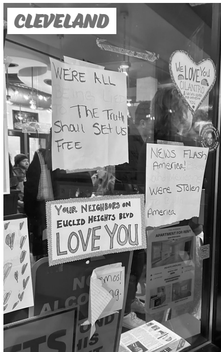
Feb. 1, 2025

Cilantro Taqueria in Cleveland Heights, Ohio, was especially crowded, even for a Saturday night, on Feb. 1. People came out to express solidarity and outrage over the arrest of six Cilantro workers by Immigration and Customs Enforcement agents on Jan. 26. The workers were taken to the ICE detention center in Geauga County, over 20 miles east of Cleveland Heights.