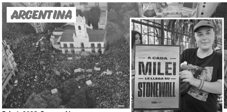
Feb. 1, 2025, Buenos Aires