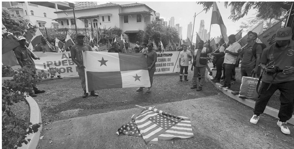
Ciudad de Panamá, el 2 de febrero de 2025. Manifestación en contra de la visita de Marco Rubio, el secretario de estado de los EE. UU.

Donald Trump está impulsado por sus ambiciones imperialistas, como cualquier