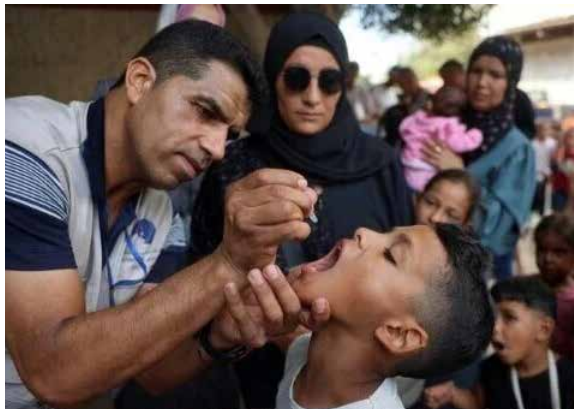
Polio vaccinations administered to children in Gaza, Sept. 2, 2024.

According to the Gaza Ministry of Health: “The vaccination campaign is crucial and requires a ceasefire so that these health teams can perform their duties effectively. It is also essential to ensure that children and their families are not endangered while traveling from their homes to the vaccination centers and to protect these teams from the constant threat of bombardment by the ‘Israeli’ occupation, which continues its genocidal war against our Palestinian people without pause.”