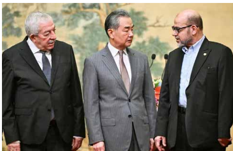
Mahmoud al-Aloul of Fatah, China's Foreign Minister Wang Yi, and Mousa Abu Marzouk of Hamas attend an event in Beijing on July 23, 2024.

European Union Special Representative for the Middle East Peace Process Sven Koopmans stressed it is a remarkable achievement and fully demonstrates China's positive and constructive role in the Middle East peace process.