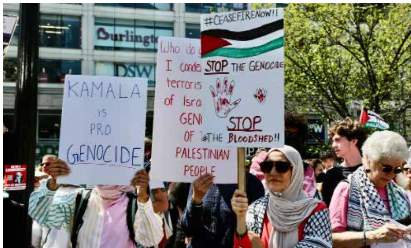
Union Square rally, New York City, Sept. 2, 2024.

If Harris chooses to ignore the international courts, as vice president she is obligated to uphold U.S. federal law that clearly states that countries receiving U.S. military support must meet