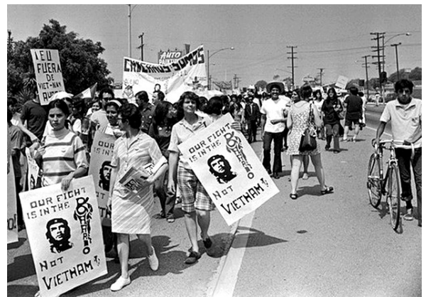
Remembering the Chicano Moratorium of 1970.

'1984' in 2024 – Standing truth on its head..... LINK