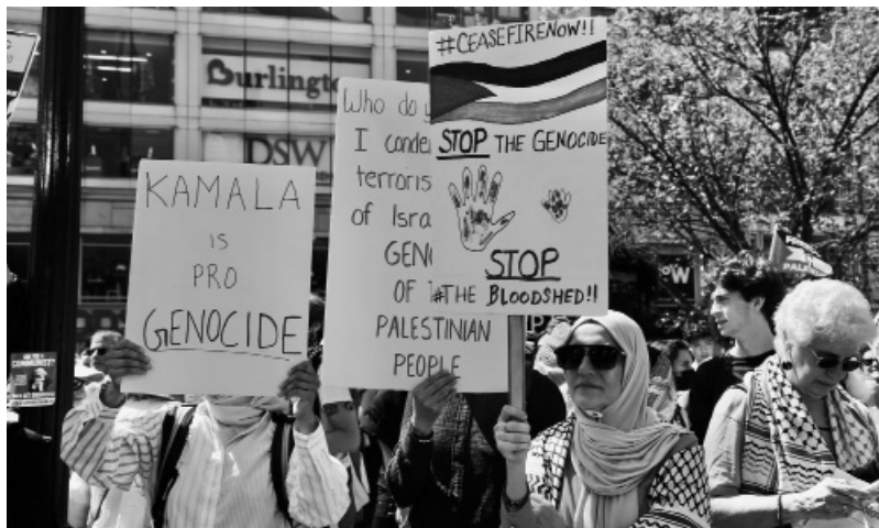
Union Square rally, New York City, Sept. 2, 2024.

If Harris chooses to ignore the international courts, as vice president she is obligated to uphold U.S. federal law that clearly states that countries receiving U.S. military support must meet