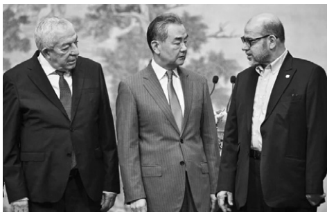
Mahmoud al-Aloul of Fatah, China's Foreign Minister Wang Yi, and Mousa Abu Marzouk of Hamas attend an event in Beijing on July 23, 2024.

European Union Special Representative for the Middle East Peace Process Sven Koopmans stressed it is a remarkable achievement and fully demonstrates China's positive and constructive role in the Middle East peace process.