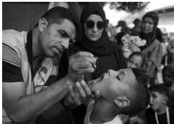
Polio vaccinations administered to children in Gaza, Sept. 2, 2024.

According to the Gaza Ministry of Health: “The vaccination campaign is crucial and requires a ceasefire so that these health teams can perform their duties effectively. It is also essential to ensure that children and their families are not endangered while traveling from their homes to the vaccination centers and to protect these teams from the constant threat of bombardment by the ‘Israeli’ occupation, which continues its genocidal war against our Palestinian people without pause.”