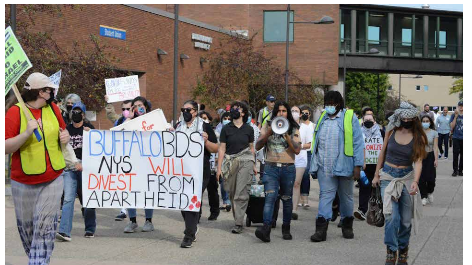
Demonstrators on University of Buffalo campus, Sept. 20, 2024.

Go to tinyurl.com/mrm4vx96 for more information. □