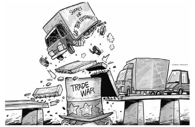
CARTOON: CHINA DAILY

China has demonstrated that by elimination of tariffs imposed on goods from developing countries both trade and development can be increased. In early September at the opening of the Forum on China-Africa Cooperation (FOCAC) summit in Beijing, China's President Xi Jinping announced that China would unilaterally give all of the least developing countries that trade with China, including 33 in Africa, zero-tariff market access for all products.