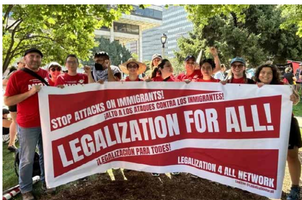
La protesta frente a la Convención Nacional Republicana anticipó la ofensiva antiinmigrante de Trump y Vance. Milwaukee, julio de 2024.

La necesidad de difundir una Gran Mentira e ignorar los hechos nunca detuvo a Trump y no lo hizo el 10 de septiembre. Simplemente tomó una historia falsa que algunos nazis supuestamente publicaron en las redes sociales y corrió con ella. La mentira de que los