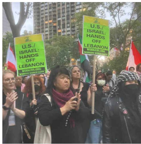
Flood Manhattan for Lebanon rally, Madison Square Park, Sept. 24, 2024.

Iran and Iraq sent medical personnel to Lebanon to assist in treating the many wounded. This includes