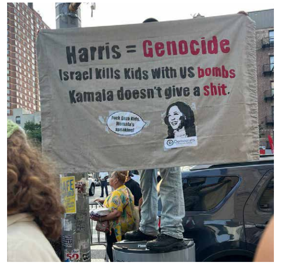
Protesta en Nueva York contra Kamala Harris, 14 de agosto de 2024. Bancarta dice: 'Harris = a genocidio, Israel mata niños con bombas estadounidenses, A Kamala le importa una mierda'

No es ninguna sorpresa que la agenda de Trump, a pesar de sus negativas, se alinee claramente con los objetivos programáticos del Proyecto 2025, un documento de extrema derecha redactado por un grupo de trabajo de