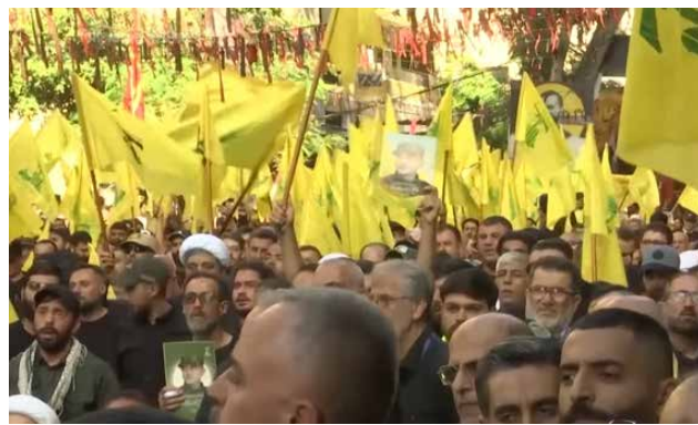
Mass funeral held in Beirut on Sept. 23, 2024, for Hezbollah military commanders assassinated by Israeli airstrikes.

of Health. Explosions occurred during the funerals of Sept. 17 victims.