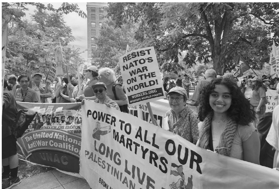
Anti-NATO protest, July 7, 2024, Washington, DC.

Workers and oppressed people in the U.S. have plenty of reasons for rejecting Donald Trump. When it comes to Harris, her strong allegiance to imperialism's global policies, in particular her defense of Israel, are likewise uncontroversial reasons for refusing to support her. □