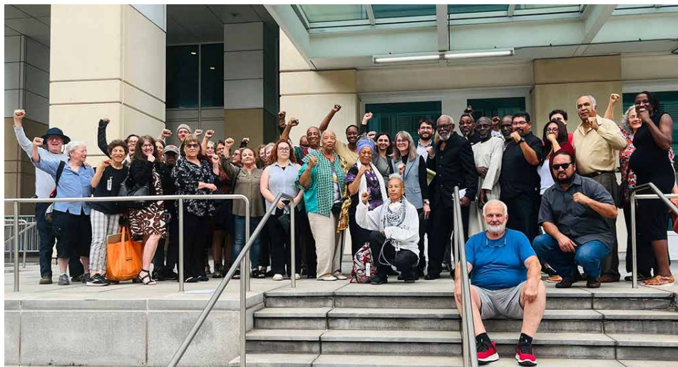
The Uhuru 3 with their comrades and supporters on the steps of the federal courthouse in Tampa, Florida, where their trial is being held.