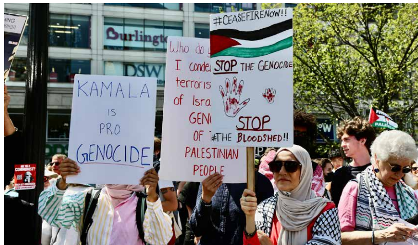
‘Kamala está en favor del genocidio.’ Manifestación en Union Square, Nueva York, 2 de septiembre de 2024.

Pero ni Harris ni su oponente republicano, el ex presidente Donald Trump, alterarán la estrecha relación del imperialismo estadounidense con el Estado israelí sólo porque el público se oponga. Tampoco les importa un ápice salvar vidas en Gaza. ¡No a Trump! ¡No a Harris! ¡No al voto por el genocidio! □