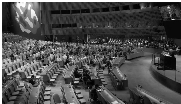
Netanyahu addresses nearly empty General Assembly hall at United Nations, Sept. 26, 2024.

The diplomats' walkout was the only visible protest inside the U.N. The New York Police Department did not allow any protesters closer than four blocks away. Thousands of protesters were kept away from the immediate area near where Netanyahu was speaking while thousands of police — all on paid overtime, funded by New Yorkers' tax dollars — were