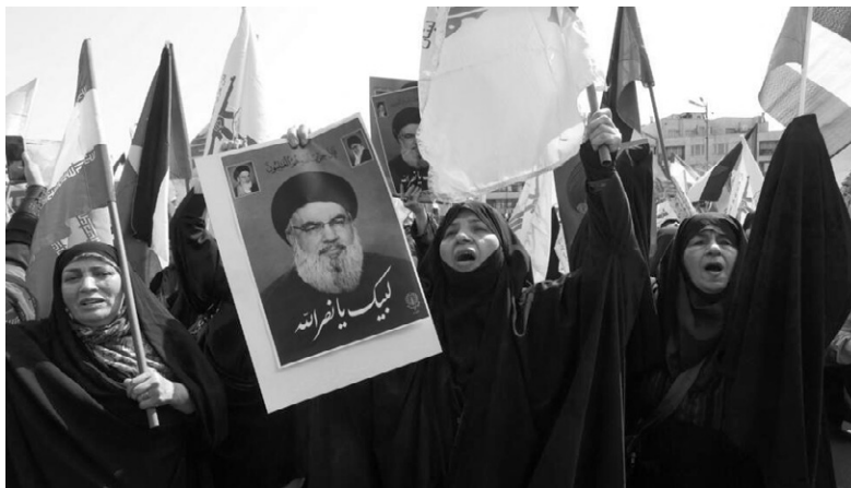
Iranian women hold pictures of Hassan Nasrallah and Palestinian flags at anti-Israel protest in Tehran, Iran, Sept. 27, 2024.

inal Netanyahu by labeling Nasrallah's murder "a measure of justice." The administration's position is no surprise. The U.S. recently granted another $8.7 billion in arms to Israel to continue its almost one-year genocide in Gaza, the West Bank and now Lebanon.