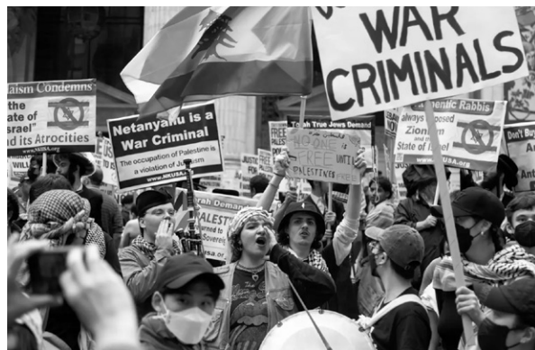
Demonstrators rallied outside the Loews Regency New York Hotel where Netanyahu stayed. New York City, Sept. 26, 2024.

The Biden administration claims it had no knowledge of this planned slaughter of thousands — using 2,000-pound bunker buster bombs, made in U.S. factories — which also resulted in the death of Sayyed Hassan Nasrallah, secretary-general of Hezbollah. But the U.S. didn't waste time in cheering on the killing once it