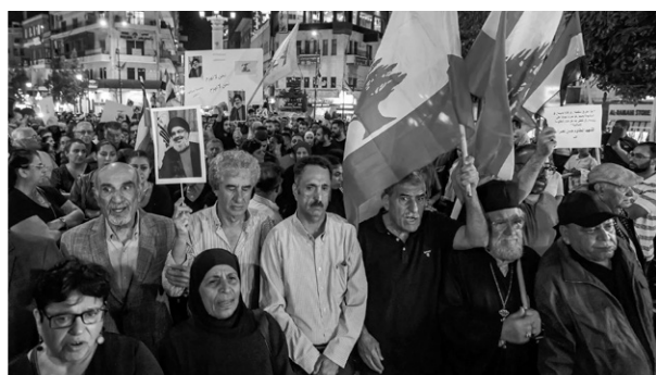
Palestinians protest Israel/U.S. bombing in Lebanon and murder of Nasrallah, leader of Hezbollah. Ramallah, West Bank, Sept. 28, 2024.