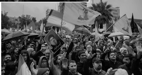
Iran announced five days of mourning for Nasrallah. Protesters in Palestine Square in Tehran, Iran, Sept. 28, 2024.