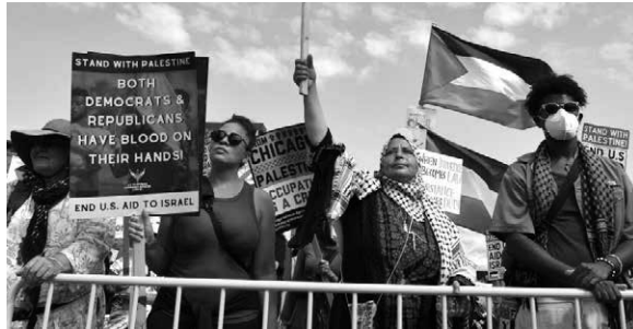
En el exterior de la Convención Nacional Demócrata, manifestantes denuncian a ambos partidos, 19 de agosto de 2024.

Mientras que las investigaciones independientes han desacreditado por completo las afirmaciones de los anuncios pro-Trump,