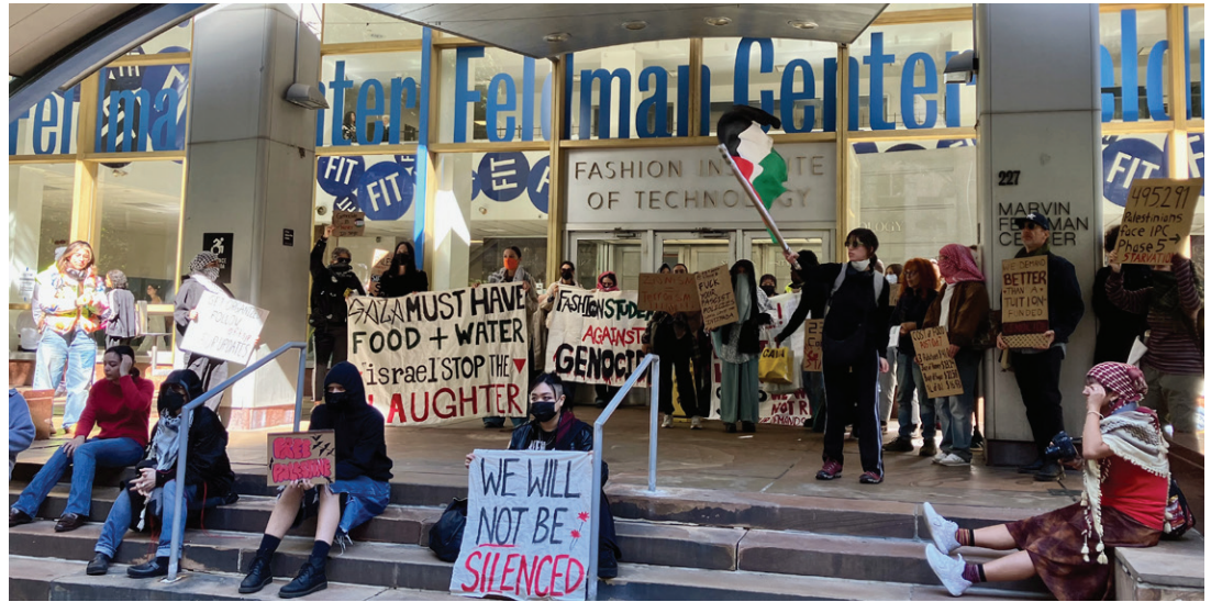
Campus struggles resume, raising slogans from stopping genocide to liberating Palestine. Fashion Institute of Technology, New York City, Oct. 10, 2024.

Workers World supports now and will support the demands and actions of the anti-imperialists and pro-Palestinian students on the campuses and on the streets. □