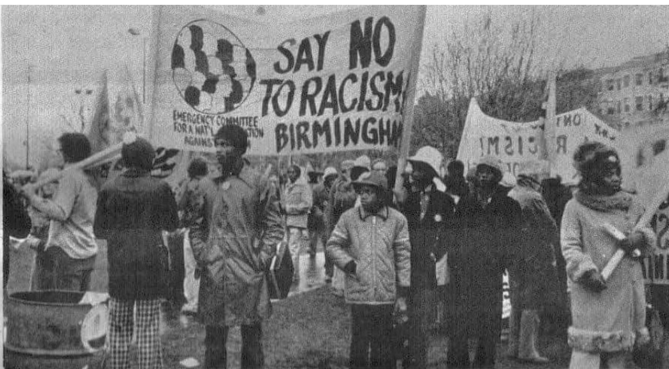
The "Solidarity Bus" from Birmingham traveled 31 hours to Boston. It departed from the 16th Street Baptist Church where, in 1963, three Black children were killed in a KKK-style terror bombing.