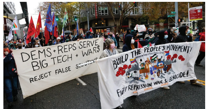
Seattle 'March and rally against Trump and the two-party war machine,' Nov. 9, 2024. Read online.