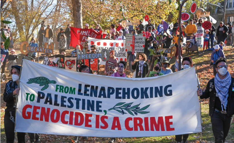
The 24th annual Peoplehood Parade and Pageant. Philadelphia, Nov. 9, 2024. Report on page 5.