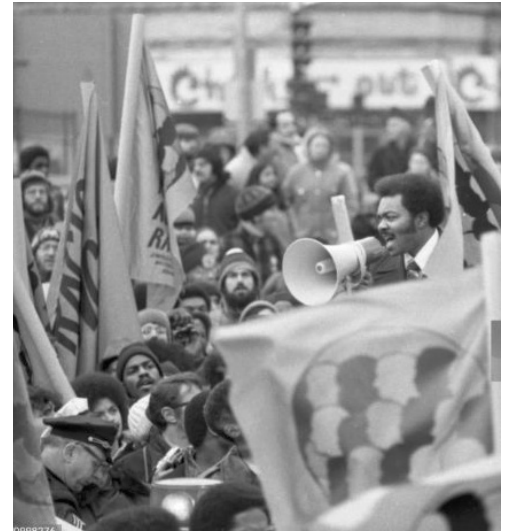
State Senator Bill Owens — chair of the Emergency Committee for a National Mobilization Against Racism — on top of a cop car leading marchers downtown Boston during the police attack on the march, Dec. 14, 1974.

After the program, participants went on a walking tour led by UMass Boston graduate