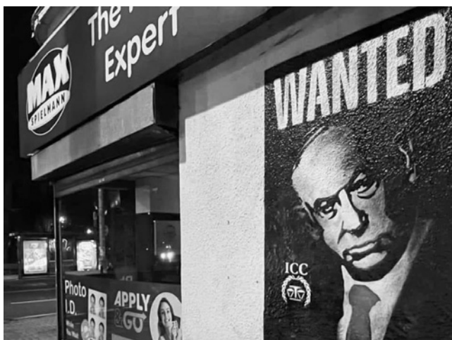
Poster on streets of Birmingham, England. See editorial on ICC warrants, page 4.