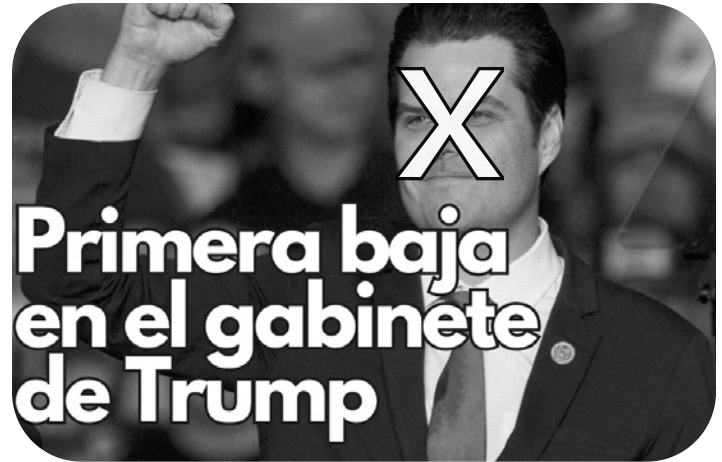
Primera baja en el gabinete MAGA es Matt Gaetz.

puede durar una sociedad de admiración mutua entre individuos que se creen cada uno el más grande. Ya lo veremos.