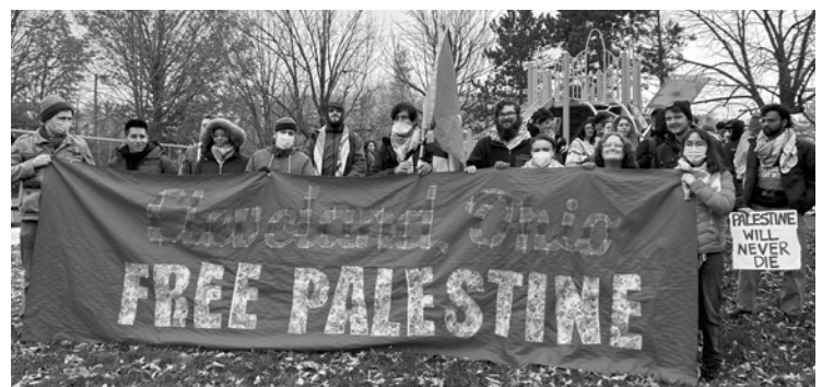
Cleveland, Nov. 24, 2024. See page 4.