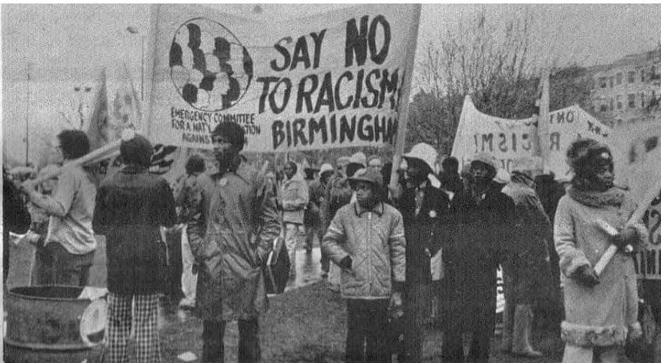
The "Solidarity Bus" from Birmingham traveled 31 hours to Boston. It departed from the 16th Street Baptist Church where, in 1963, three Black children were killed in a KKK-style terror bombing.