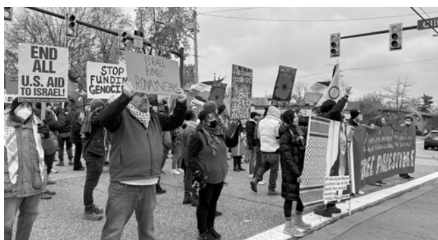
Cleveland, Nov. 24, 2024.

About a half dozen people were given citations for noise violations. Demonstrators remained at the site until everyone arrested was released. As they marched back to the park where they had gathered, even without amplification the chanting could be heard from blocks away. □