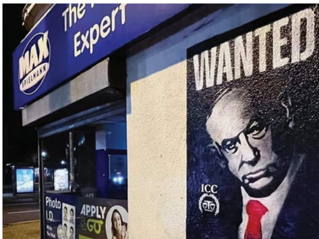
Poster on streets of Birmingham, England. See editorial on ICC warrants, page 4.