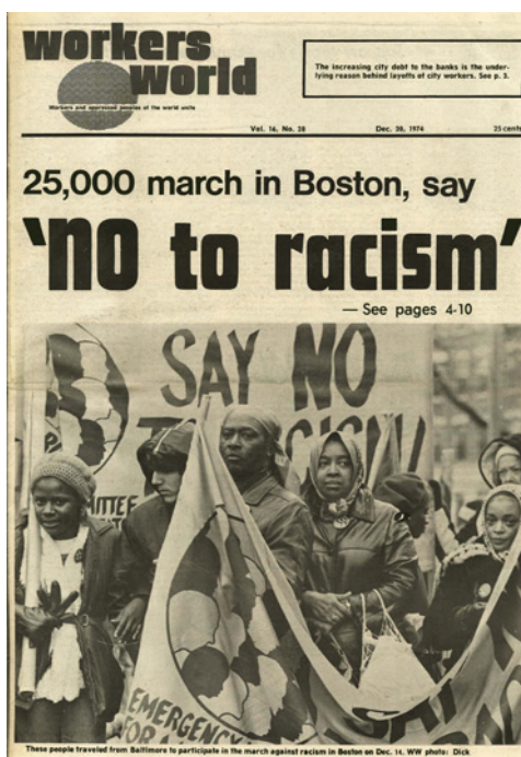
Front page Workers World, Dec. 20, 1974.

As Gillis noted, bourgeois historians continue to ignore the rally in favor of a sanitized narrative about "forced busing." This "tragedy"-mongering historiography — such as the 2023 PBS documentary "The Busing Battleground" which leaves the