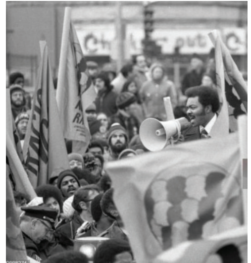
State Senator Bill Owens — chair of the Emergency Committee for a National Mobilization Against Racism — on top of a cop car leading marchers downtown Boston during the police attack on the march, Dec. 14, 1974.

After the program, participants went on a walking tour led by UMass Boston graduate