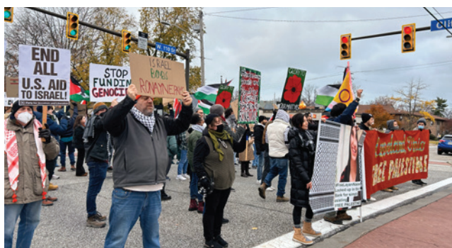
Cleveland, Nov. 24, 2024.

About a half dozen people were given citations for noise violations. Demonstrators remained at the site until everyone arrested was released. As they marched back to the park where they had gathered, even without amplification the chanting could be heard from blocks away. □