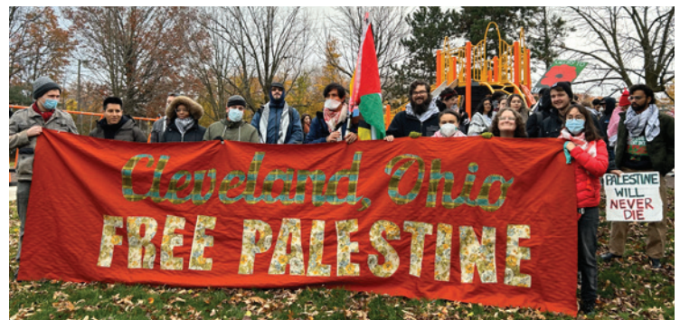
Cleveland, Nov. 24, 2024. See page 4.