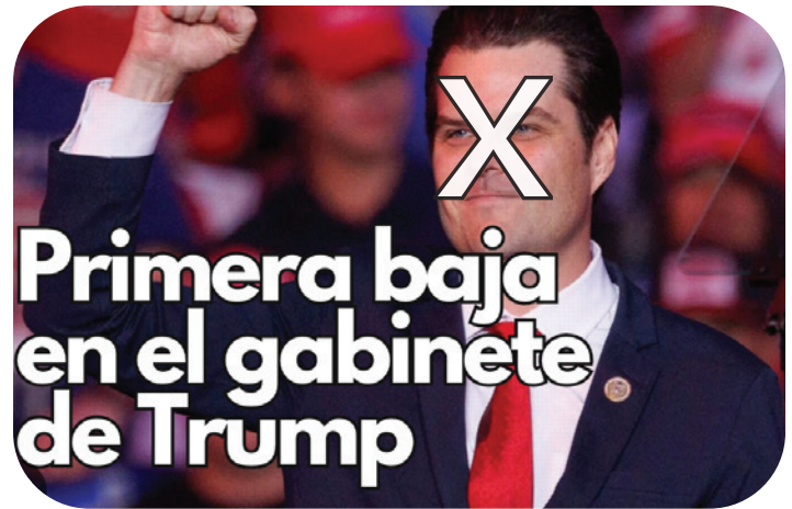
Primera baja en el gabinete MAGA es Matt Gaetz.

puede durar una sociedad de admiración mutua entre individuos que se creen cada uno el más grande. Ya lo veremos.