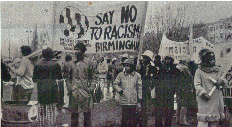
The "Solidarity Bus" from Birmingham traveled 31 hours to Boston. It departed from the 16th Street Baptist Church where, in 1963, three Black children were killed in a KKK-style terror bombing.