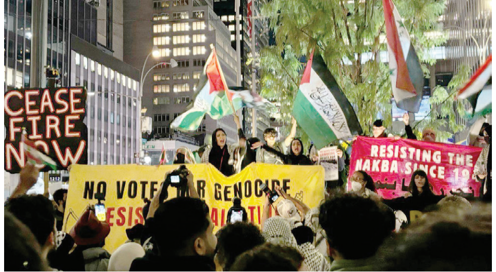
Protesta en Nueva York contra el genocidio en Gaza, 5 de noviembre de 2024.

Los resultados electorales de este año requerirán un gran análisis marxista reflexivo en las próximas semanas y meses. Tenemos que tener una visión histórica, científica y dialéctica sobre el colapso del liberalismo burgués y la socialdemocracia.