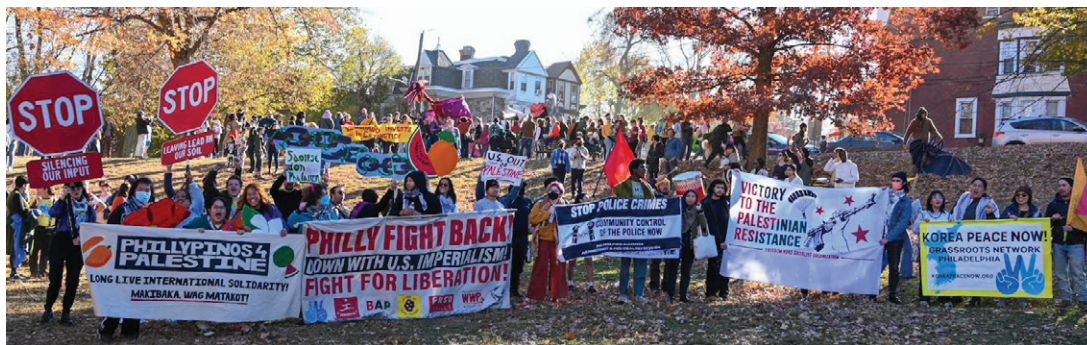
The 24th annual Peoplehood Parade and Pageant. Philadelphia, Nov. 9, 2024.

“The Peoplehood Parade joyfully lifts up PEOPLE, especially the everyday Philadelphians working toward collective liberation,” is how Spiral Q describes their yearly event. Coming just days after the election of