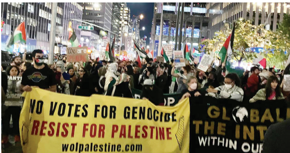
Protesta en Nueva York contra el genocidio en Gaza, 5 de noviembre de 2024.

La resistencia empieza ahora. ¡Organízate, organízate, organízate! □