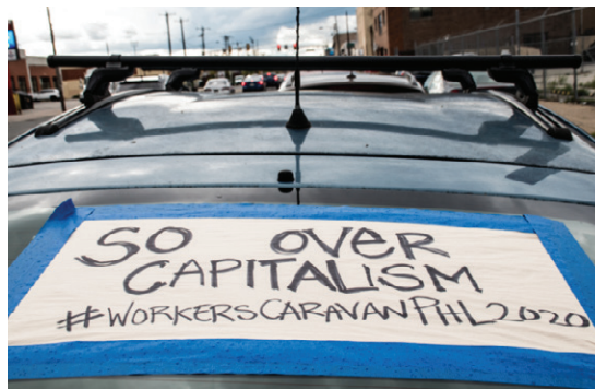
May 1, 2020 protest, Philadelphia.

"Amazon founder Jeff Bezos' wealth grew $7.1 billion a week after defending his decision to withhold the Washington Post's endorsement of Vice President Kamala Harris. Oracle cofounder Larry Ellison, another Trump supporter, saw his net worth rise $5.5 billion Wednesday."