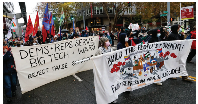
Seattle 'March and rally against Trump and the two-party war machine,' Nov. 9, 2024. Read online.