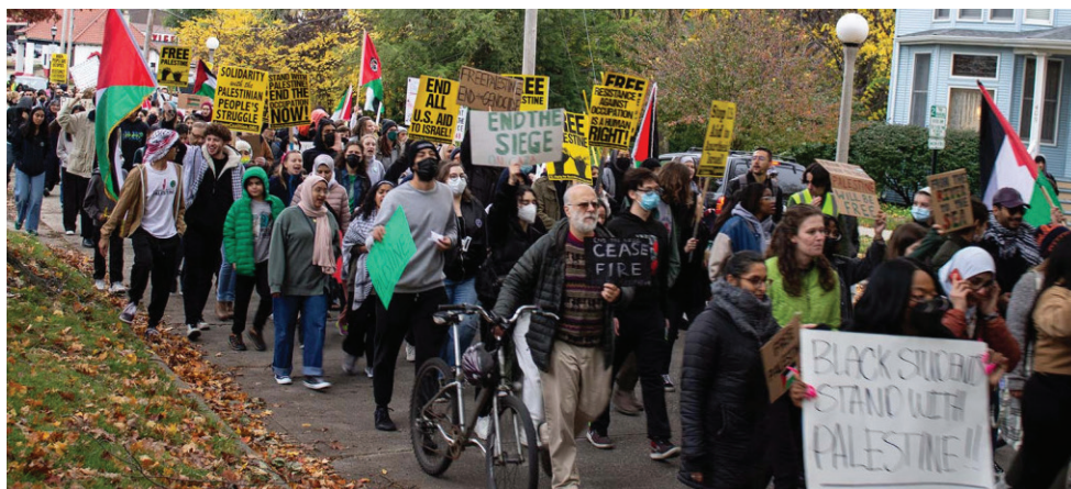
March against genocide in Palestine. Urbana, Illinois, Oct. 28, 2023.

Whether or not the proposal impacts legislation, it is a clear indication that there is powerful growing antipathy to the genocide in Gaza and to its cost and its inhumanity. More and more people of different backgrounds but similar passions are willing to struggle together for what they believe in. □