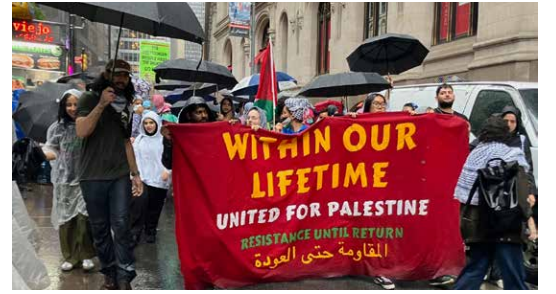
MO FOTO: BRENDA RYAN

A pesar de la lluvia torrencial, miles de personas protestan en Manhattan contra la masacre israelí de palestinos desplazados en el campo de Rafah, 27 de mayo de 2024.