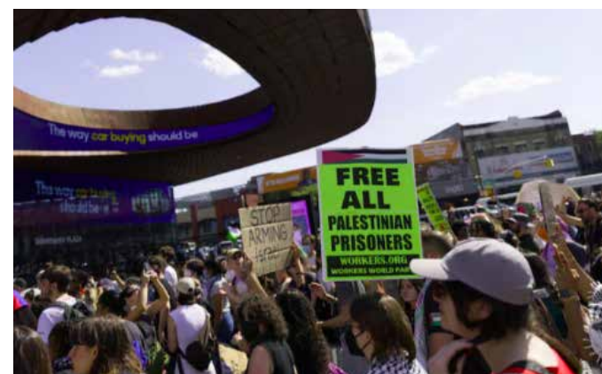
Brooklyn, New York, May 31, 2024

Despite the almost daily demonstrations in New York City, the movement to free Palestine is not slowing down; it is only increasing. In fact, one day after this demonstration in Brooklyn, a new encampment at Columbia University was started and was called "Revolt for