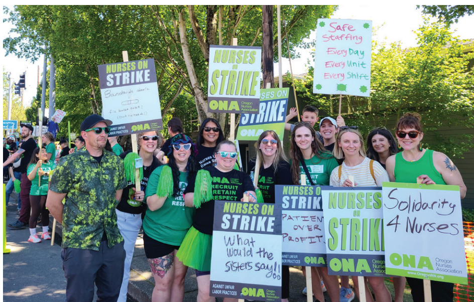
Portland, Oregon, June 19, 2024.

Hudson stressed: “We are united, demanding that we return to work as a unit to deliver the quality care we are trained for, that feels gratifying.” □