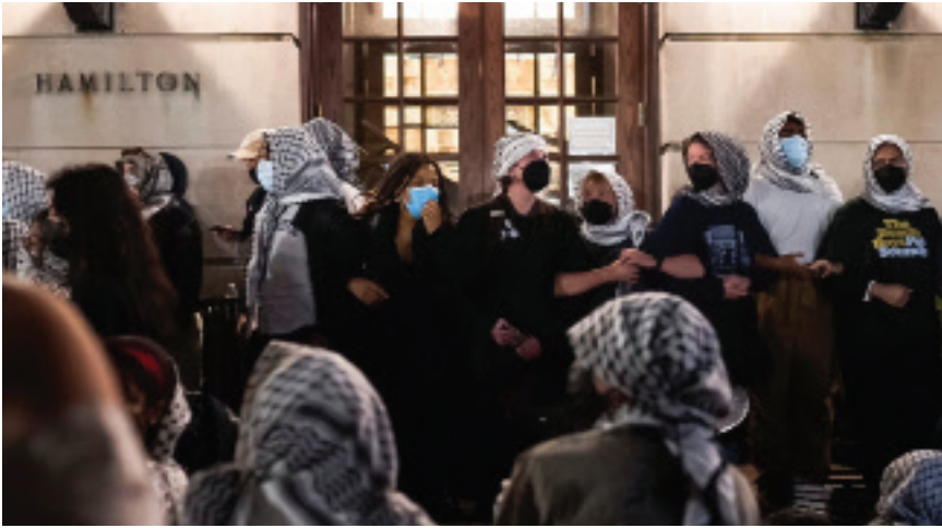
Columbia University students de-occupy Hamilton Hall aka Hinds Hall, April 30, 2024.