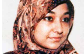
Dr. Aafia Siddiqui

years, mass demonstrations have been held in the U.S., Pakistan and elsewhere demanding her freedom.