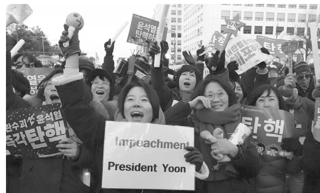
Koreans celebrate vote to impeach President Yoon Seok-Yeol. Seoul, Dec. 14, 2024.

Under both Republican and Democratic administrations, Washington has put in motion plans to build a