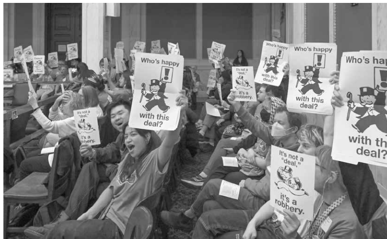
Arena opponents hold signs and chant against the billionaires and their enablers in city government, Philadelphia, Dec. 11, 2024.

Fearful of an influx of predatory developers, residents