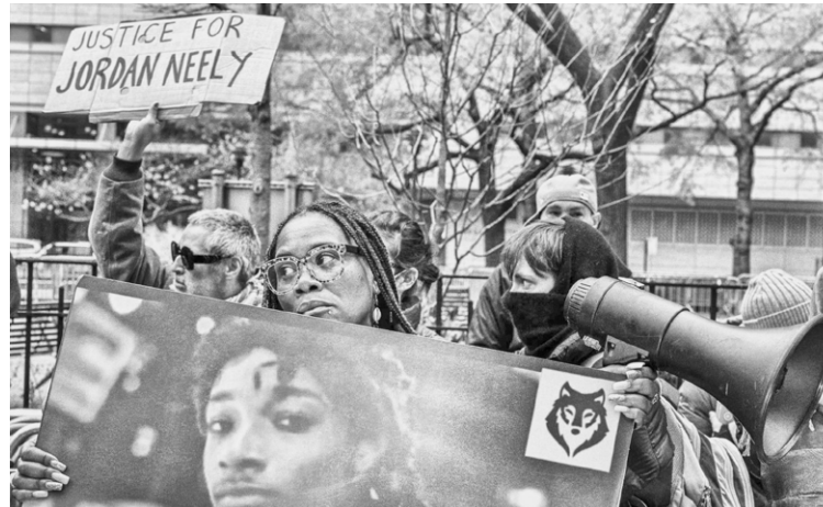
Protest outside Manhattan Criminal Courthouse, where the trial of racist killer Daniel Penny was taking place.

During the 2020 uprisings after the murder of George Floyd and others at the hands of police, some of the more moderate demands raised by protesters included better