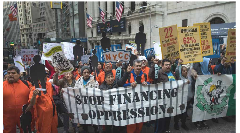
Demonstrators demand that Wall Street stop bankrolling private prisons, New York, May 1, 2018.

In the coming fight against the next Trump administration, workers need to unite against attacks on our migrant/immigrant siblings and for the jobs and education that everyone needs. □