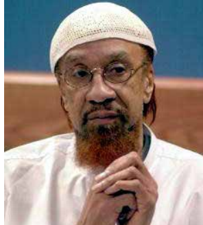
Imam Jamil Abdullah Al-Amin

Second, there is Leonard Peltier . He is a member of the Turtle Mountain Band of Chippewa Indians and a longtime leader of the American Indian Movement. He was falsely sentenced to two life prison sentences in 1977 for allegedly killing two FBI agents in 1975 on the Pine Ridge Reservation in South Dakota. He is currently incarcerated in the United States Federal Penitentiary, Leavenworth, in Kansas, and was recently denied parole in September. His supporters are demanding a compassionate release for the 80-year-old Peltier based on his failing health due to the lack of humane health care.