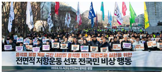
Korean Confederation of Trade Unions rallies to demand South Korean President Yoon's impeachment.

Workers in Italy conducted various strikes in early December. Several unions rallied and struck in Florence on Dec. 11. The Italian General Confederation of Labour (CGIL), the Italian Confederation of Trade Unions and the Italian Labour Union: Transport (UILTrasportil)