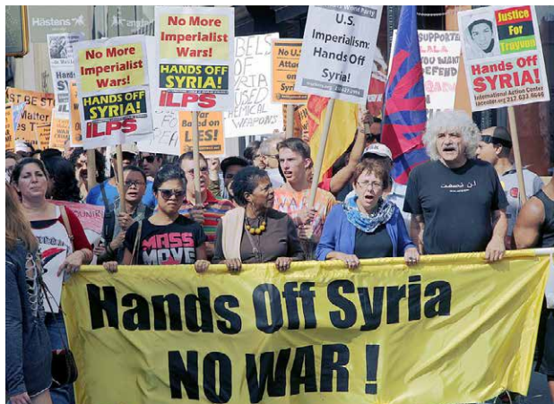
7 de septiembre de 2013, Nueva York.

Después de que en 2011 Estados Unidos respaldara y financiara a mercenarios y fuerzas terroristas, cuyo