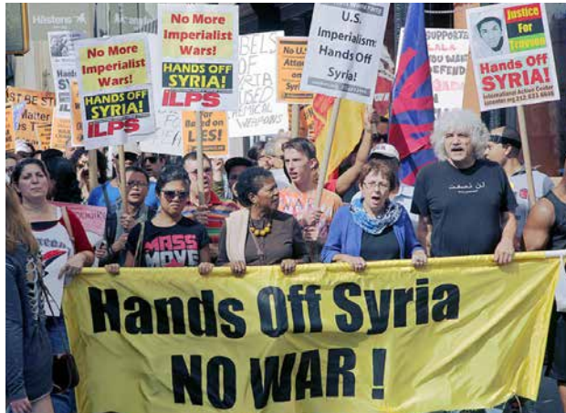
7 de septiembre de 2013, Nueva York.

Después de que en 2011 Estados Unidos respaldara y financiara a mercenarios y fuerzas terroristas, cuyo