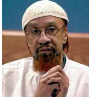
Imam Jamil Abdullah Al-Amin

Second, there is Leonard Peltier . He is a member of the Turtle Mountain Band of Chippewa Indians and a longtime leader of the American Indian Movement. He was falsely sentenced to two life prison sentences in 1977 for allegedly killing two FBI agents in 1975 on the Pine Ridge Reservation in South Dakota. He is currently incarcerated in the United States Federal Penitentiary, Leavenworth, in Kansas, and was recently denied parole in September. His supporters are demanding a compassionate release for the 80-year-old Peltier based on his failing health due to the lack of humane health care.