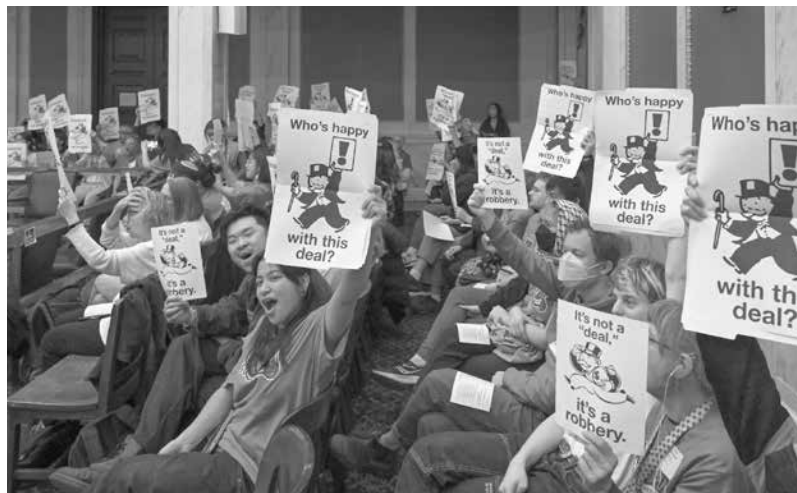
Arena opponents hold signs and chant against the billionaires and their enablers in city government, Philadelphia, Dec. 11, 2024.

Fearful of an influx of predatory developers, residents