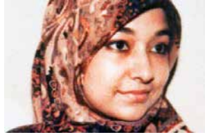
Dr. Aafia Siddiqui

years, mass demonstrations have been held in the U.S., Pakistan and elsewhere demanding her freedom.