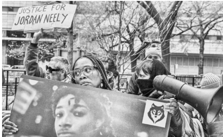
Protest outside Manhattan Criminal Courthouse, where the trial of racist killer Daniel Penny was taking place.

During the 2020 uprisings after the murder of George Floyd and others at the hands of police, some of the more moderate demands raised by protesters included better