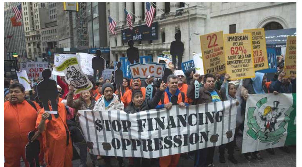
Demonstrators demand that Wall Street stop bankrolling private prisons, New York, May 1, 2018.

In the coming fight against the next Trump administration, workers need to unite against attacks on our migrant/immigrant siblings and for the jobs and education that everyone needs. □