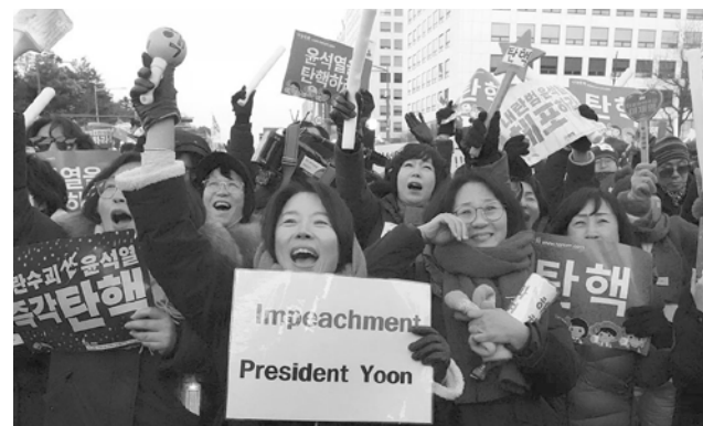
Koreans celebrate vote to impeach President Yoon Seok-Yeol. Seoul, Dec. 14, 2024.

Under both Republican and Democratic administrations, Washington has put in motion plans to build a