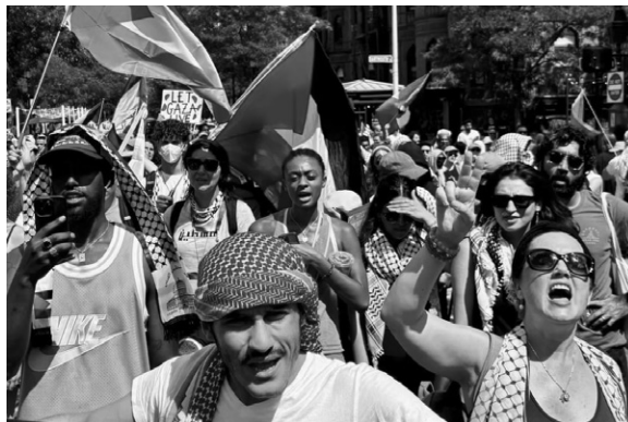
Boston, Aug. 3, 2024.

As speakers at Saturday's rally emphasized, the Zionist regime's murderous rampage only