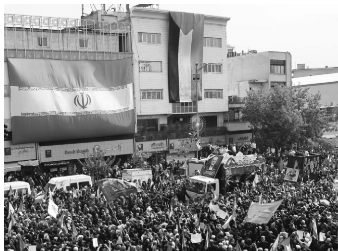
Massive funeral procession for Hamas leader, Ismail Haniyeh, in Tehran on Aug. 1, 2024.

Israel has been unable to militarily defeat Hamas in Gaza and now could seriously unleash a four-prong war with Iran, Lebanon, Iraq and Yemen. Israel's occupying forces have suffered an estimated 10,000 casualties of combined deaths and wounded at the hands of the resistance.