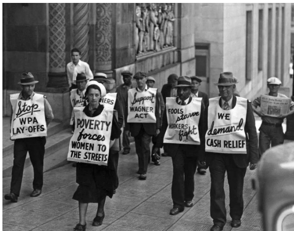
Unemployed workers march during the 1930s Great Depression.

The Dow’s decline is not merely a “market reaction,” but a reflection of the underlying contradictions of capitalist production. The stock market, driven by the profit motives of capitalists, reacts to perceived threats to profitability. As job creation slows and unemployment rises,