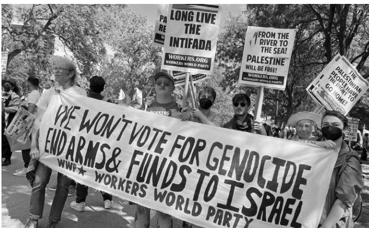
Chicago, Aug. 19, 2024.

Today’s demonstrations were the second march of a week of protests planned for the duration of the DNC. The organizations and individuals present plan to hold additional protests each day of the convention, which is scheduled to last until Thursday, Aug. 22. □