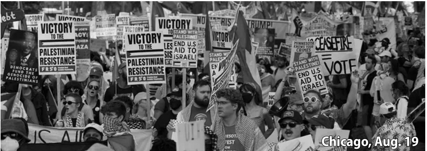
Chicago, Aug. 19

Workers and oppressed peoples of the world unite! workers.org Vol. 66, No. 34 August 22, 2024