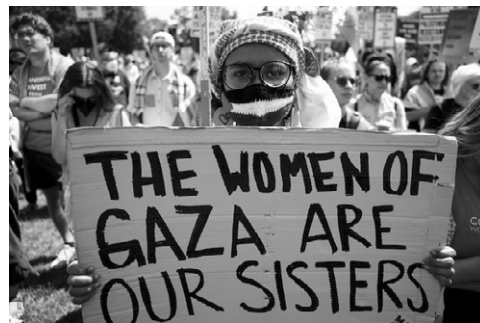
‘Las mujeres de Gaza son nuestras hermanas’, Chicago, fuera de la Convención Demócrata Nacional, 19 de agosto de 2024.

Independientemente de otras cuestiones en las que demócratas y republicanos puedan parecer discrepar tácticamente, ha habido un apoyo bipartidista inquebrantable a Israel desde que se creó el Estado del apartheid en 1948. Incluso los pocos demócratas «progresistas» del Congreso, en su mayoría, no han ido más allá de pedir un alto el fuego en Gaza. Y son una pequeña minoría, que se hará más pequeña con las derrotas — orquestadas y