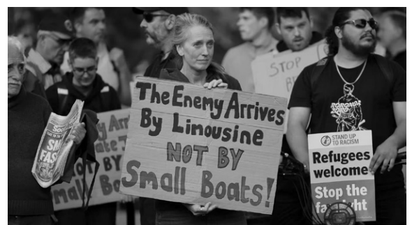
Mass rallies against far right in Britain. Read online