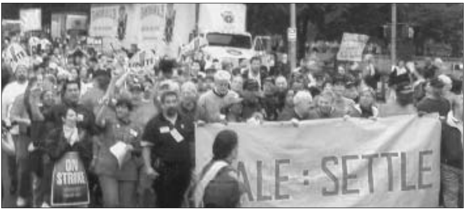
Thousands of Yale workers and supporters shut down New Haven on Sept. 13.

cross picket lines. Those who tried to hold classes on campus found they couldn't get away from the strike: Workers chanted outside the classrooms with bullhorns. (Newsday, Sept. 23)