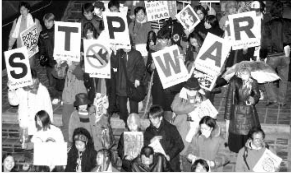
Tokyo, Japan, March 15.

participation was in Greece, Italy, Spain and Germany.