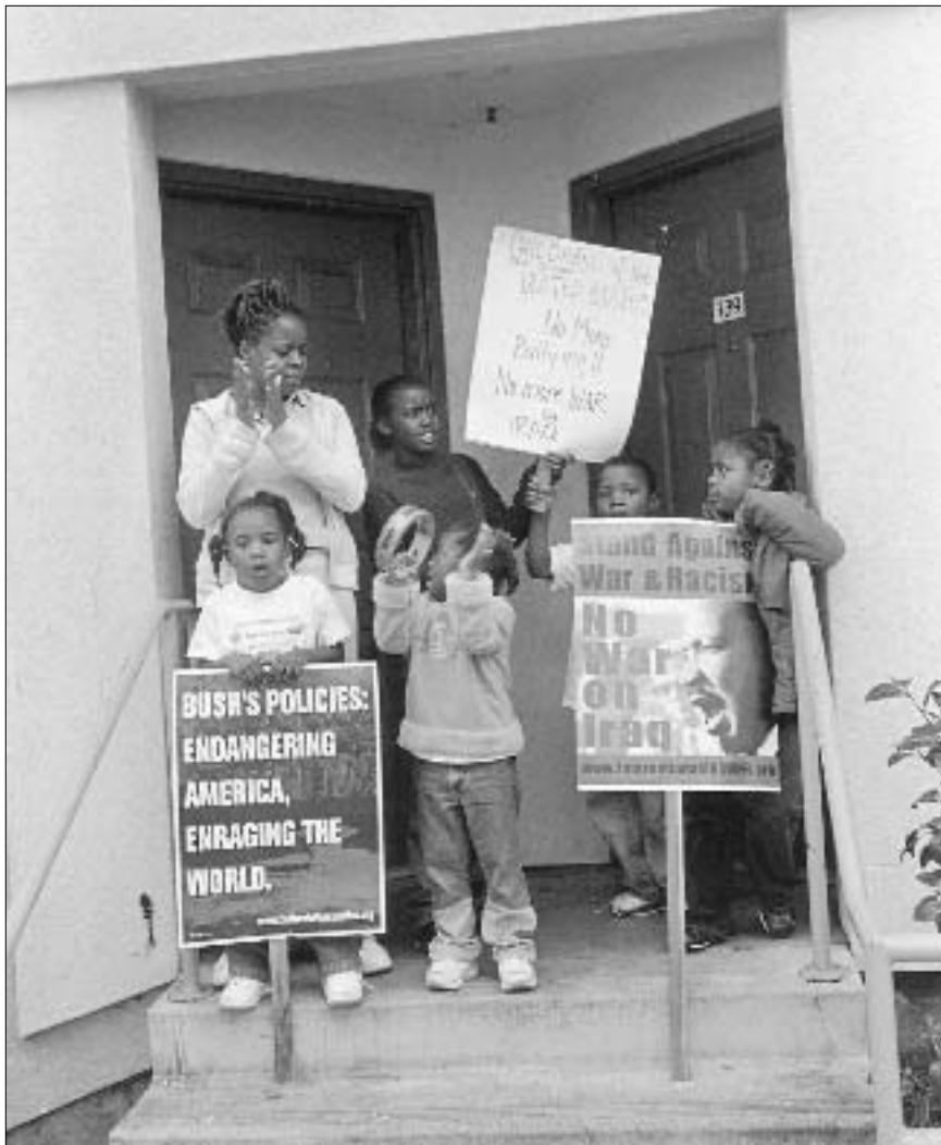
Residents of Western Addition, a predominately African American community in San Francisco, demonstrate their support for anti-war protesters March 15.

International ANSWER coalition The Greens/Green Party USA Not In Our Name Project NYC Forum of Concerned Religious Leaders New York City Labor Against the War