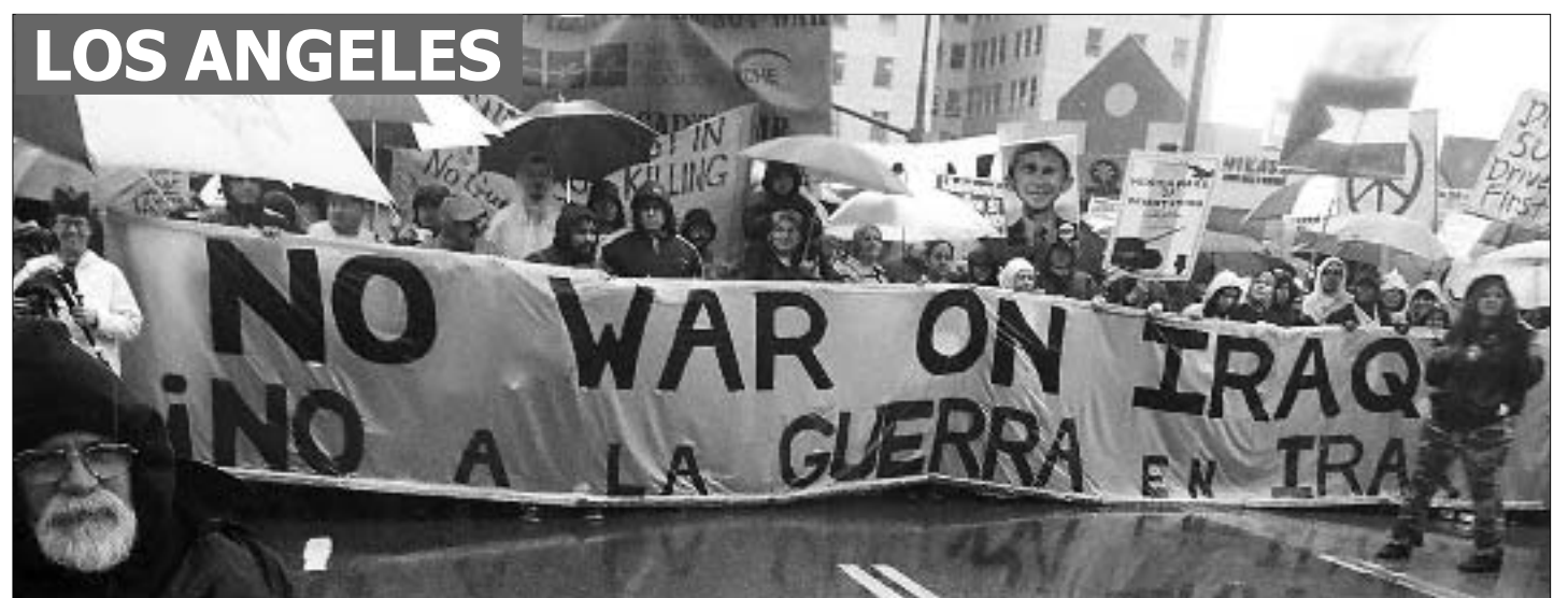
Los Angeles, March 15. Pictured in lower left corner is Ron Kovic, disabled veteran and anti-war activist.

"The fact that on one of the worst days of the year in Los Angeles, over 50,000 people would turn out to say no to war proves that the message of today is: as Bush and his crowd become weaker and weaker, we of the peace movement of the