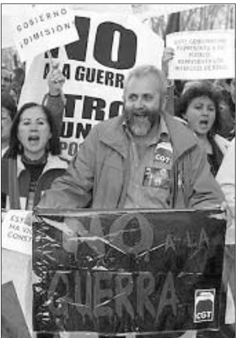
Madrid, Spain, March 15.

As the U.S. attack approaches, this movement has begun job actions, strikes, boycotts, e-mail campaigns, blocking trains and ships, anything to stop the war before it starts. On March 14 workers throughout Europe followed the call of the Confederation of European Trade Unions and "crossed their arms" at noon for 15 minutes in a symbolic general strike. The strongest