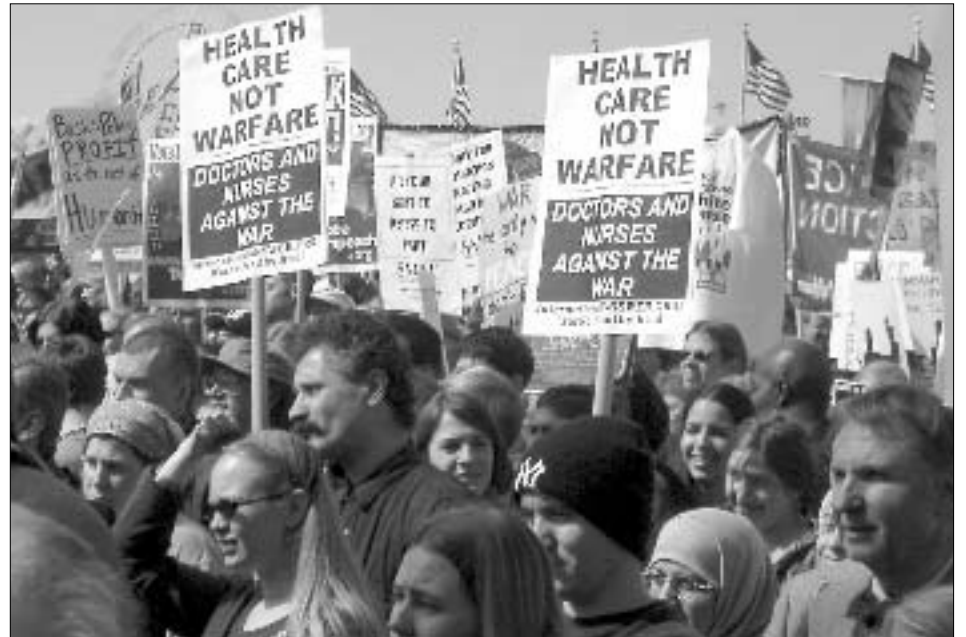
Washington, D.C., March 15.