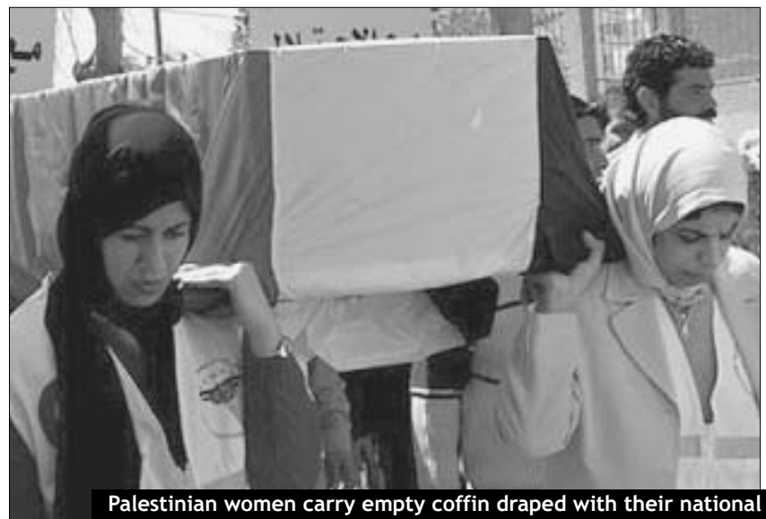
Palestinian women carry empty coffin draped with their national flag through the streets of Gaza City to show solidarity with Rachel Corrie.