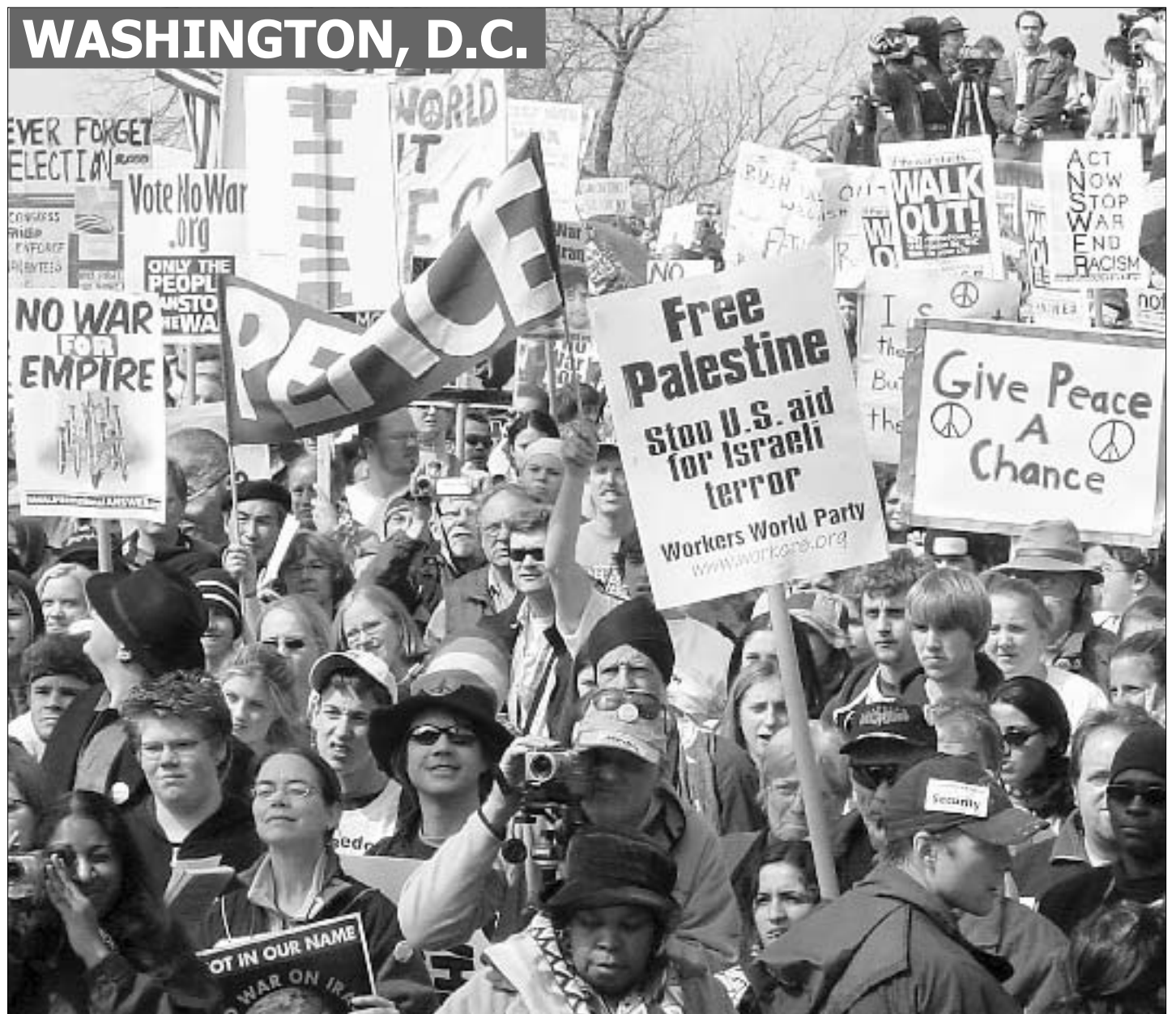
Washington, D.C., March 15.