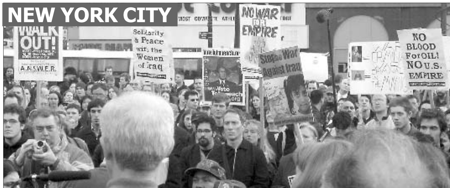
March 18 protest at New York's Union Square Park.

Dennis Brutus, a former political prisoner under the apartheid South African regime, urged everyone to remain vigilant in opposing the war. □