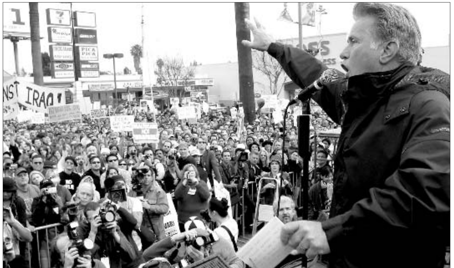
Martin Sheen speaks to anti-war protest in Los Angeles on Jan. 18.