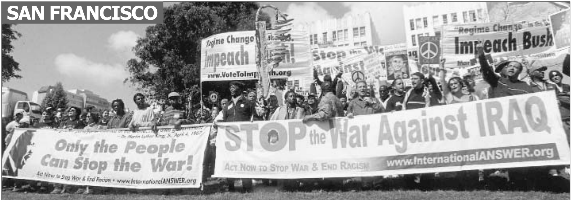
San Francisco, March 15.