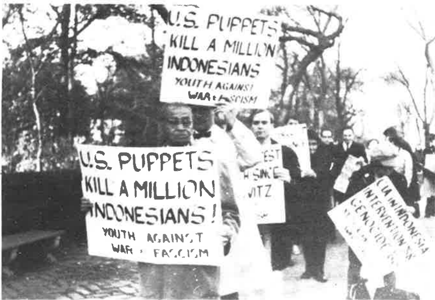
The Supreme Court says you can't demonstrate in front of a bosses' prison. Shown above are people demonstrating before the Indonesian Consulate in NYC. Court may be gunning for them, too.