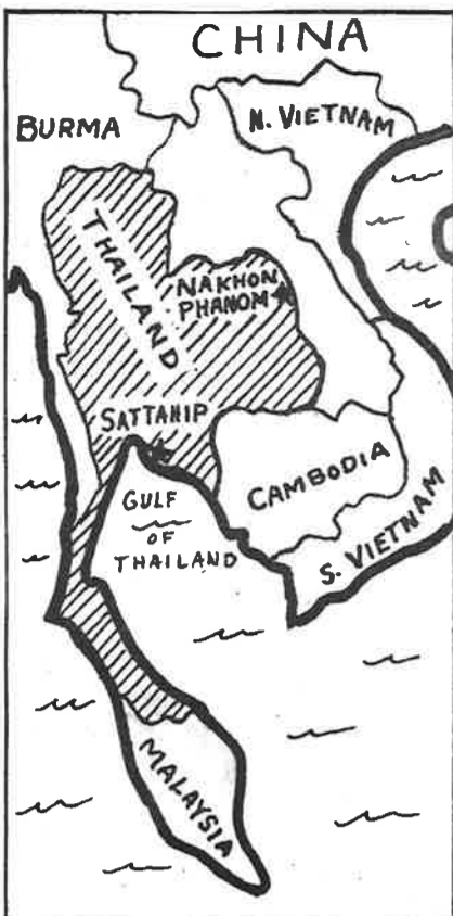
Thailand is 15 minutes' flying time from Vietnam

It is clear what Johnson meant when he said as he prepared to leave South Korea. "I leave today with a deep sense of confidence in the future of Asia and the Pacific."