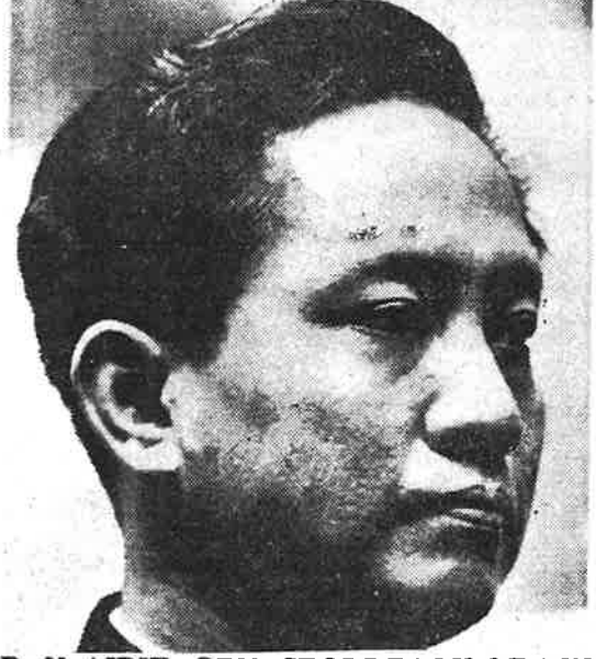
D. N. AIDIT, GEN. SECRETARY OF PKI

lot of criticism for continuing military aid — at that time we could not say what that military aid was for. Is it secret any more?