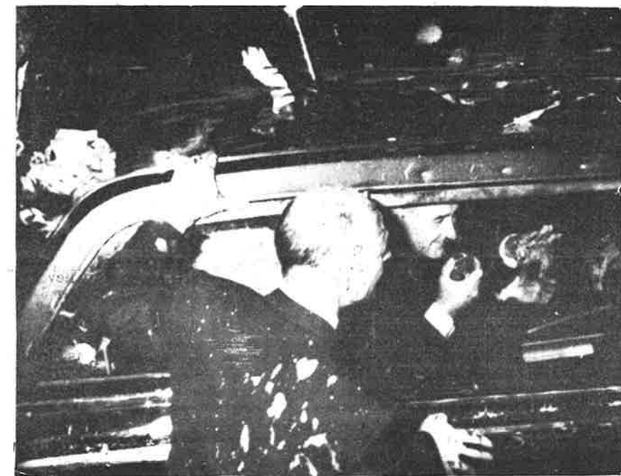
Johnson's car was splattered in Melbourne. U.S. policy needed a new paint job after this one!

Australia stands not "as Asia's southern anchor," but as U.S. finance capital's southern pillar of support for its "Pacific power." Some of the Australians have already found this out.