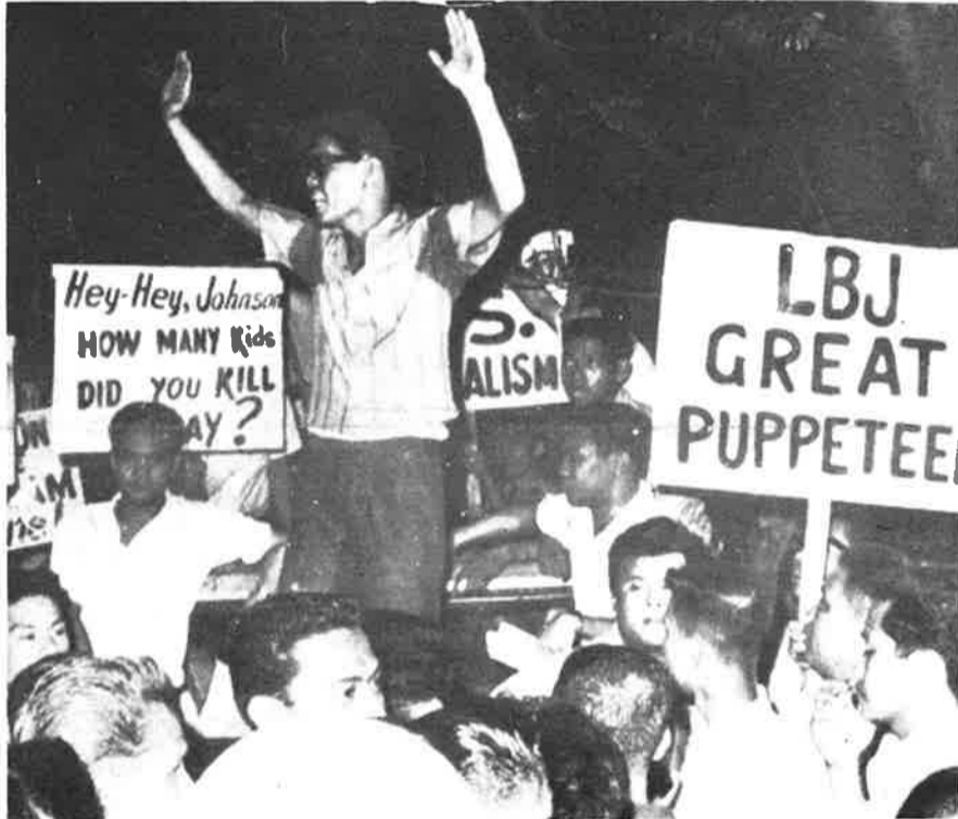
At the U.S. Embassy, Manila, Oct. 24, during Johnson's visit.

The Look Magazine story quotes a professional U.S. soldier as saying: