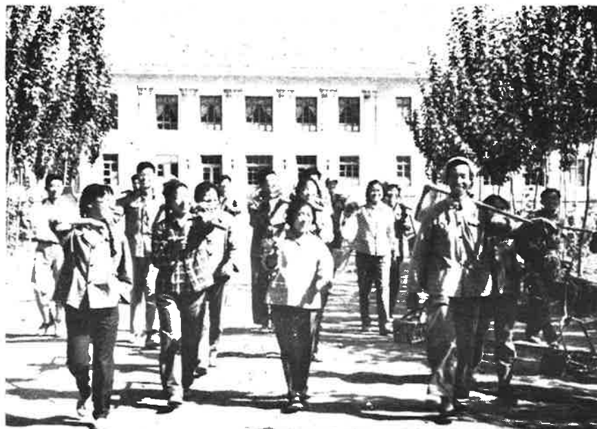
Students at Tarim University leaving their classrooms to work in the fields. These are the new kind of intellectuals that are growing up in People's China today.

When U.S. science is unchained by the socialist revolution, the Chinese promise will be redeemed in the American — and world — performance!