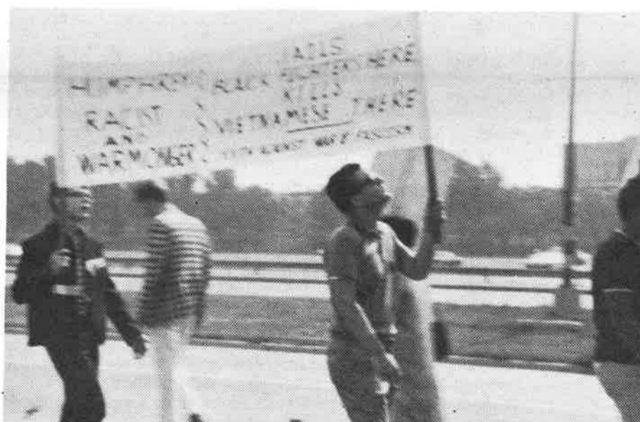
Meeting Humphrey at the Cleveland airport.