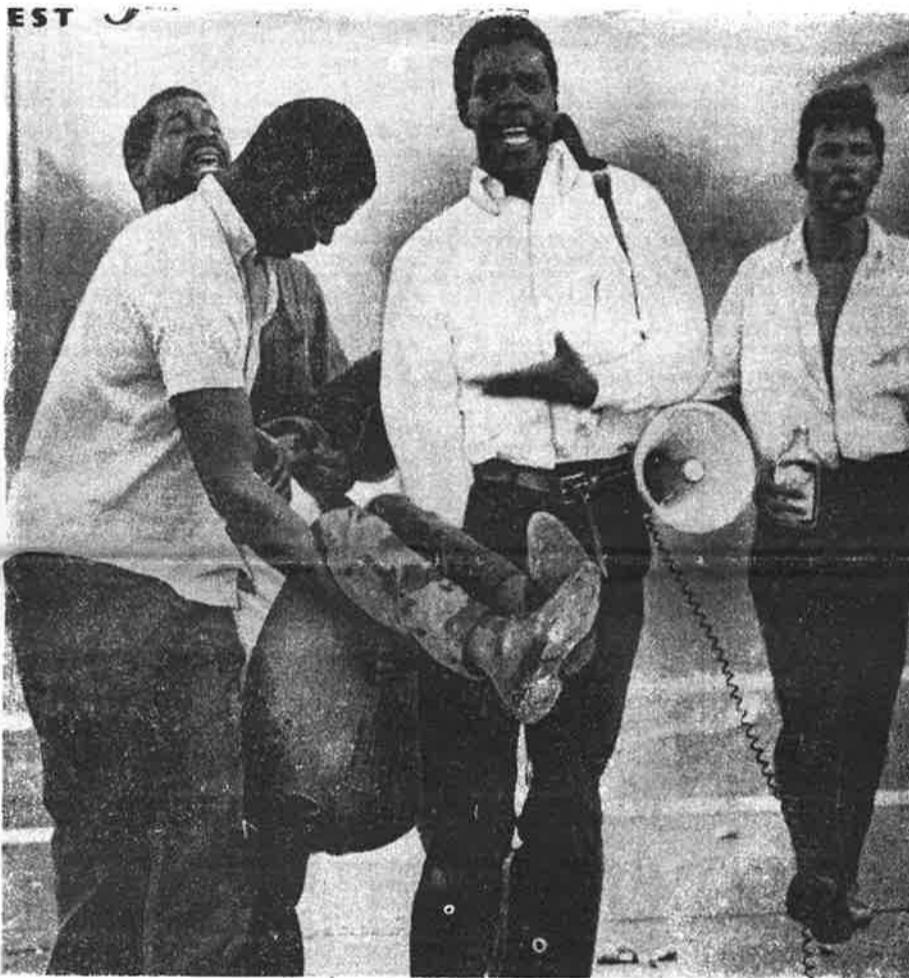
The cops shot this man on Third Street in San Francisco for the crime of being black.

As we go to press, large numbers of white progressive demonstrators are picketing in sympathy with the black struggle.