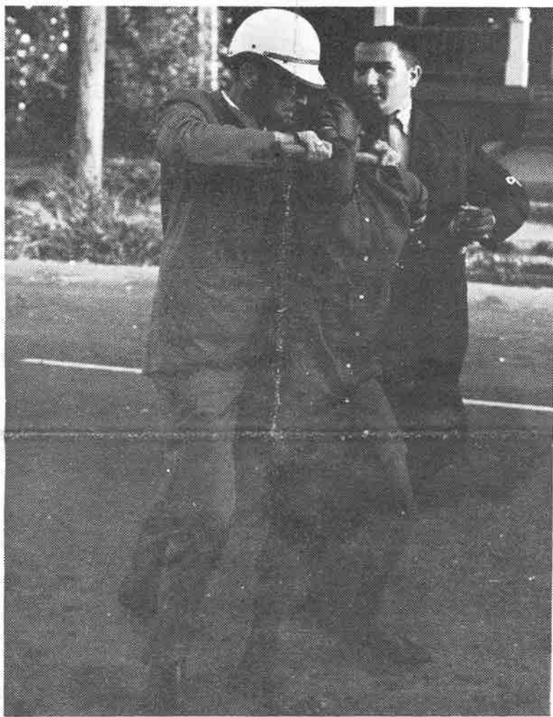
Gestapo in Atlanta Sept. 6 — SNCC Photo by Rufus Hinton