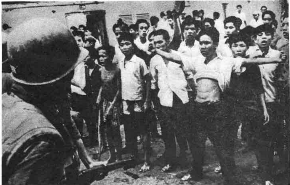
The near-civil war in South Vietnam's cities did not begin yesterday. Here are young students and workers defying the police over two years ago. Struggles have been almost continuous for 34 years.