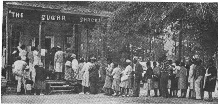
Lining up for the Alabama Democratic primary on May 3. The "liberal" ruling class was very proud of this picture. But black militants are already breaking from the Democrats to start their own party.

And with the bigoted pugilist Wallace, who made his proxy comeback, still their hero, the racists of Alabama have asked for a fight. As far as the Black Panthers are concerned, they are going to get it.