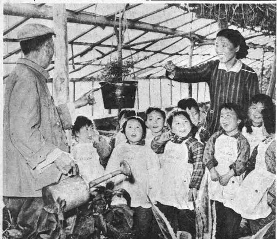
Kindergarten children in China spend a day learning how green things grow.