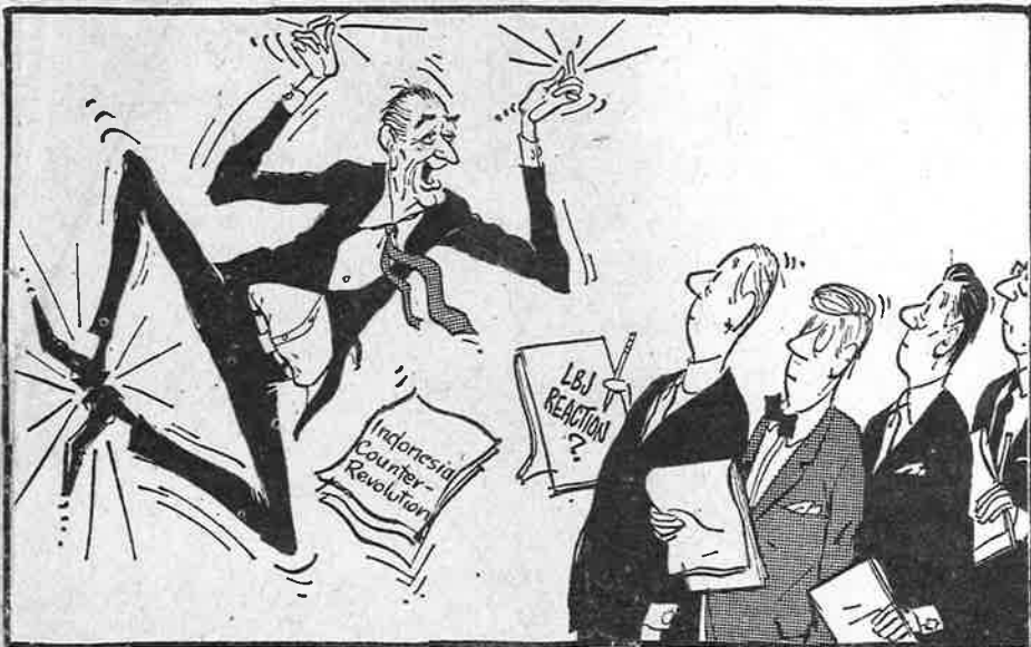
"-AND REMEMBER, THIS IS OFF THE RECORD"

And how quiet the revisionists are today when the imperialists make such statements as that the U.S. "program of responsible containment" of the Soviet Union has been successful - as Humphrey did on the occasion when he gave the Judas kiss to China!