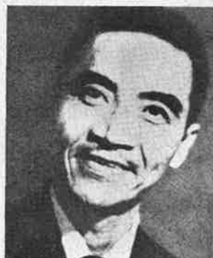
HUYNH TAN PHAT Vice President of NLF