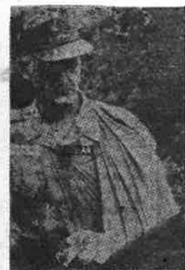
The general broke his wrist playing tennis in Vietnam. He may now be sent to a safer area.