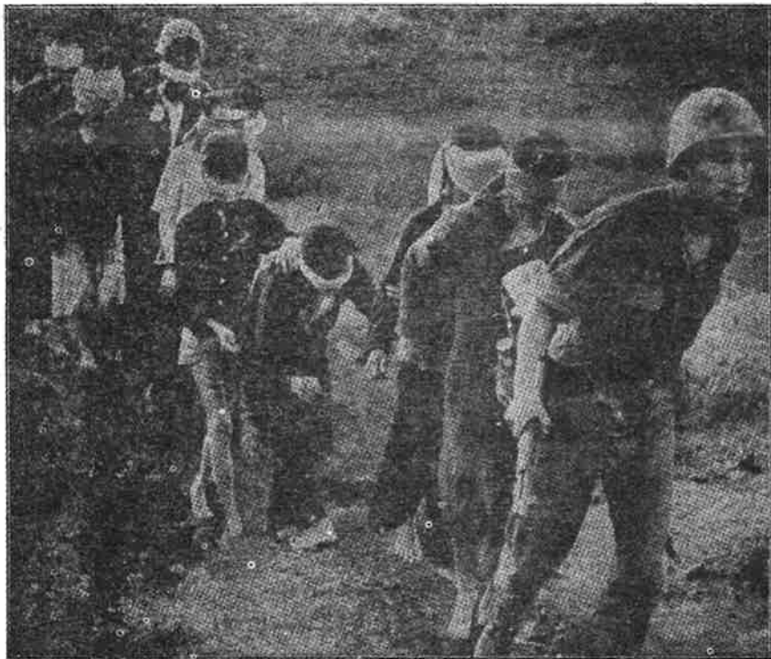
Above, a Korean soldier in Vietnam leads 10 "suspected Viet Cong" bound and blindfolded to a prison compound. Note the extreme youth of one prisoner, the old age of another and the fact that one is a woman.

As part of its strategic plan to expand the war in Southeast Asia, U.S. big business has exacted from its South Korean pawn a promise to send still more troops to Vietnam.