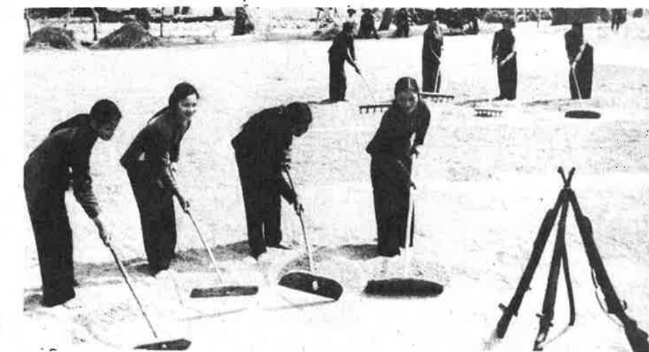
Members of an agricultural cooperative in Thanh Hoa Province sunning their bumper rice harvest with stacked rifles ready against bombing planes!

In addition, many new small-scale irrigation projects were built all over the country. Seven provinces in the middle reaches of the Red River all overfulfilled their 1965 targets for water conservancy work.