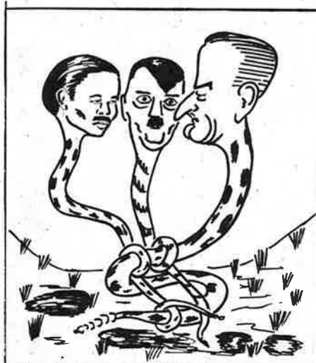
All three from the same snake-pit!

Taylor and the hawks say that if they pour enough fire and death into Vietnam the Vietnamese will be forced to surrender. Gavin and Kennan, on the other hand, are fearful that the U.S. will be defeated militarily as it takes on the revolutionary masses of Asia — and they are right.