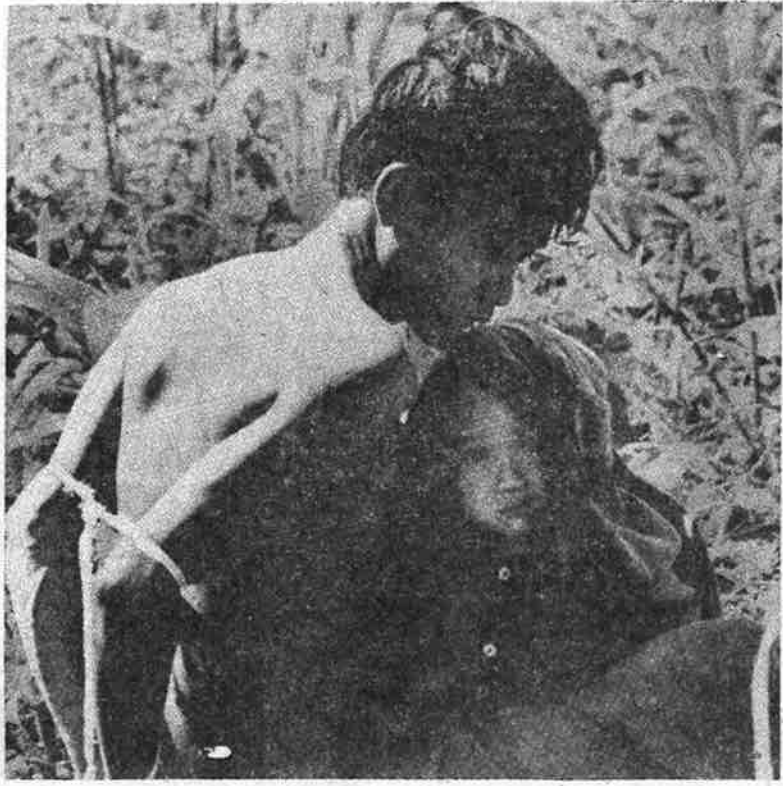
Vietnam: His dad is "suspected" of defending their country!

Behind the Senate hearings, as behind the public argument on Vietnam generally, is the ugly debate in the ruling class over whether to attack People's China, use nuclear weapons and sacrifice millions of American youth as well.