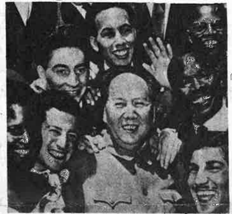
... and the oppressed shall be united!