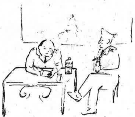
"Why couldn't we just shoot them when they turn in their Green Berets?"

"Before the Marines reach Hoi An — with their backs protected — 80 square kilometers (about 30 square miles) of land must be pacified. At that, the Marine estimate of New Year's Day, 1968, is not far away." (Our emphasis.)