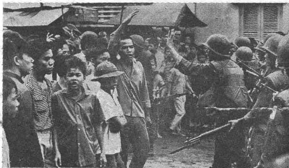
U.S. war propaganda says Vietnamese people are behind U.S. war—at least in Saigon. Above photo shows Saigon workers on strike last year facing U.S.-paid Viet troops.