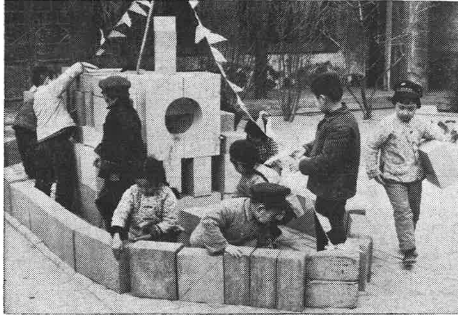
Learning to build—in a Peking kindergarten.

And if the war is enlarged to a war between the U.S. and China, he added, it would be "catastrophic" for Japan's stability "and might bring civil war."