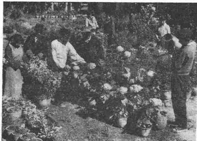
These are former serfs who once had to fight with street dogs over scraps of food.

The building of the Nangtzesahg (former municipal government) still stands there, but it is no longer a dreaded torture chamber. Many medieval instruments of torture were taken from the