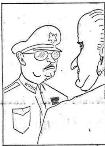
"... at the highest, not more than 100 million casualties. The shelters are ready for US."