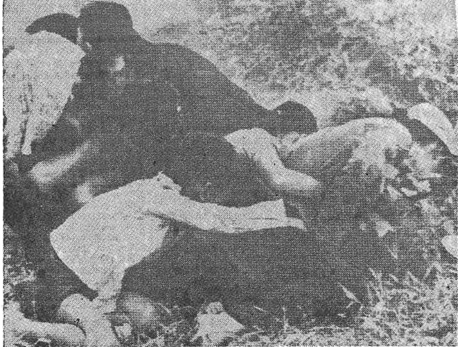
Vietnamese children under fire, huddling with their mothers August 4 as U.S. bullets whistle overhead. Eight women and children were killed that day.