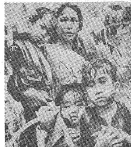
Refugees from U.S. terror