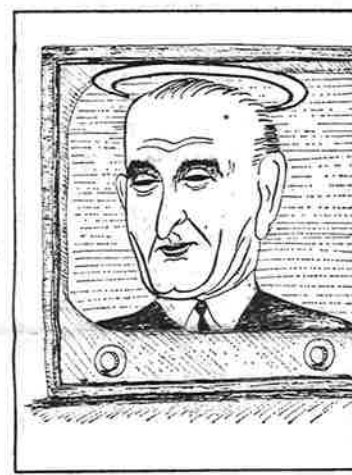
"I do not find it easy to send the flower of our youth, our finest young men, into battle..."