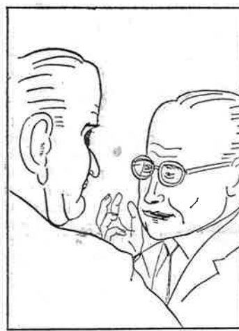
"The make-up man is here, Mr. President. That woman's letter will sound better if you..."