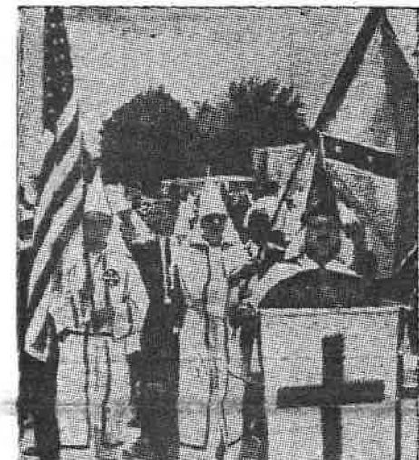
After the march, they held rally with appropriate display of U.S., and Confederate flags.