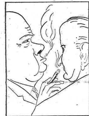
"You're absolutely right, Lyndon. Our whole investment program will be in trouble."