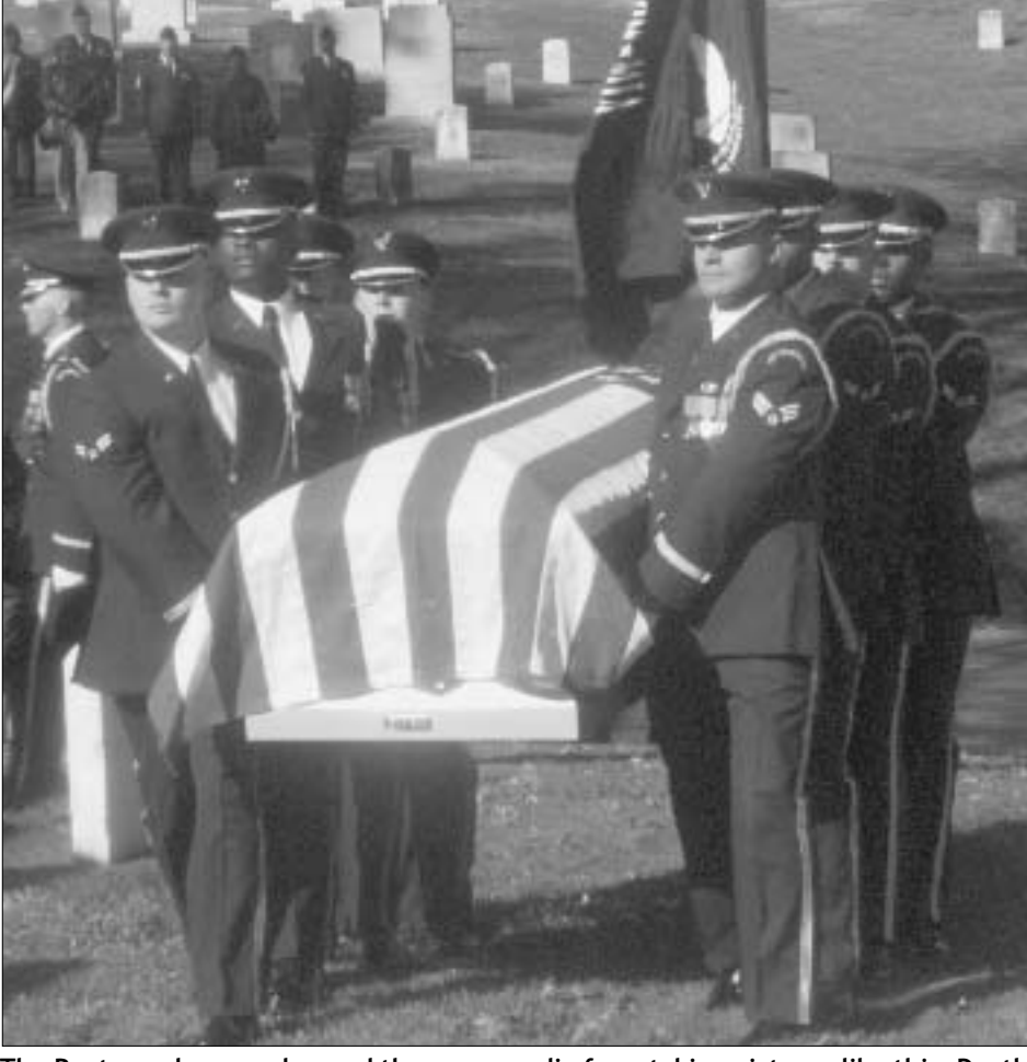
The Pentagon has now banned the news media from taking pictures like this. Death is bad for morale.

Prior to the U.S. invasion of Iraq in 2003 a similar, although less contentious, debate emerged over slogans and some of the same political forces were involved. This time some of the antiwar forces who a decade earlier had insisted on economic sanctions as an alternative to war called on