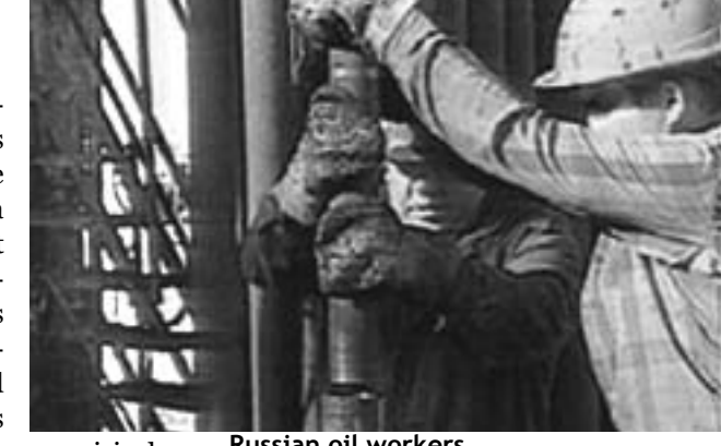
Russian oil workers.

The oil imperialists of the U.S. and Britain have a century of experience in