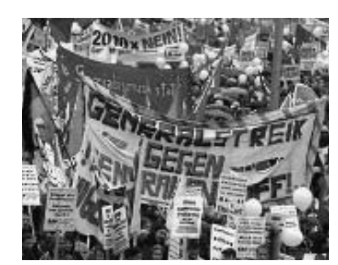
Seattle has come to Germany.

In an attempt to wring more profits from a highly productive labor force,