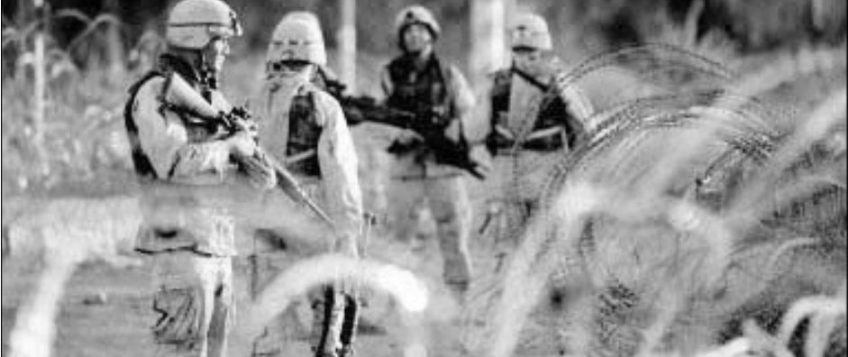
Washington wants to hog Iraq's wealth for U.S. monopolies, but U.S. troops, shown above, want out.

After the Baghdad government collapsed there was a growing effort to again make the UN part of the U.S.-British occupation machinery and to line up countries