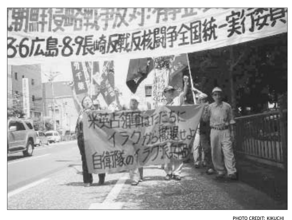
Answer delegates participate in Nagasaki anti-imperialist march on Aug. 8.

Street Action, a youth organization, held a spirited march through Hiroshima. They chanted "Don't send soldiers to Iraq," Stop the nuclear war drive," "Block the road to war on North Korea," "Remove Koizumi" and, in English, "No war! No more war!" Many demonstrators