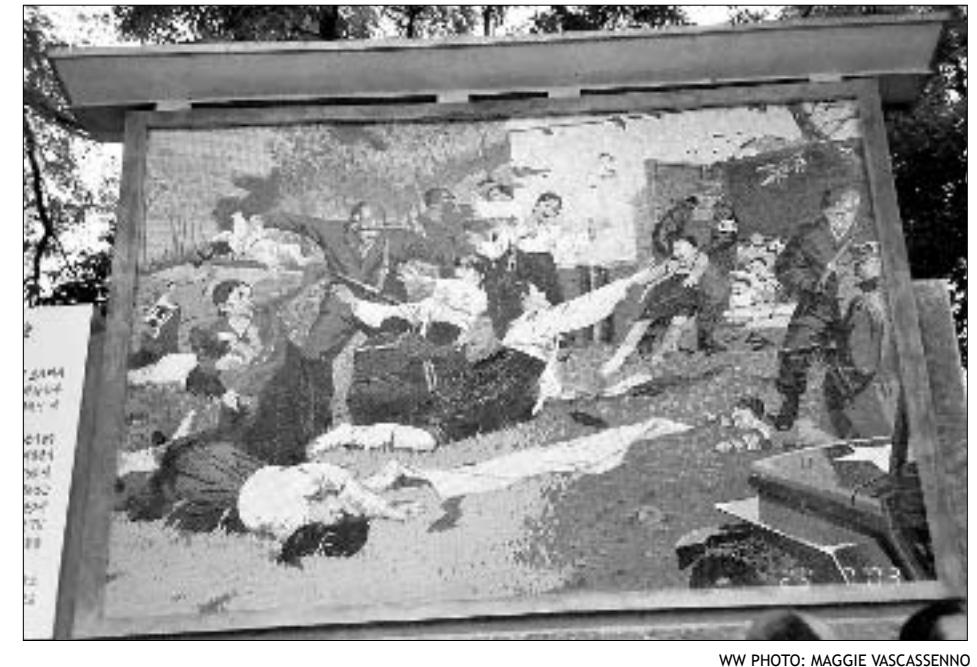
This dramatic mural at the Sinchon Museum depicts U.S. war atrocities during the Korean War.

The group saw a video entitled "Korea's Answer," which chronicles all the attempts by the DPRK to use dialog to prevent another war with the U.S. It shows how the Bush administration has worked against the process of peaceful reunification and has attempted to starve the North Korean