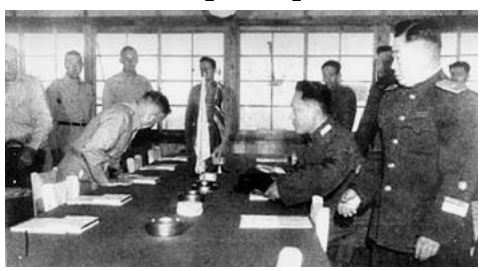
The United States government was forced to sign an armistice with the DPRK in 1953 after three years of ferocious war.

reject this, and have demonstrated their opposition to war and aggression. The colonial-style occupation of Iraq is now generating a movement among the U.S. troops to be sent home. As members of the working class, they are coming to realize that they have no interest in being imperial occupiers for the predatory oil companies and corporations that are looting Iraq's resources.