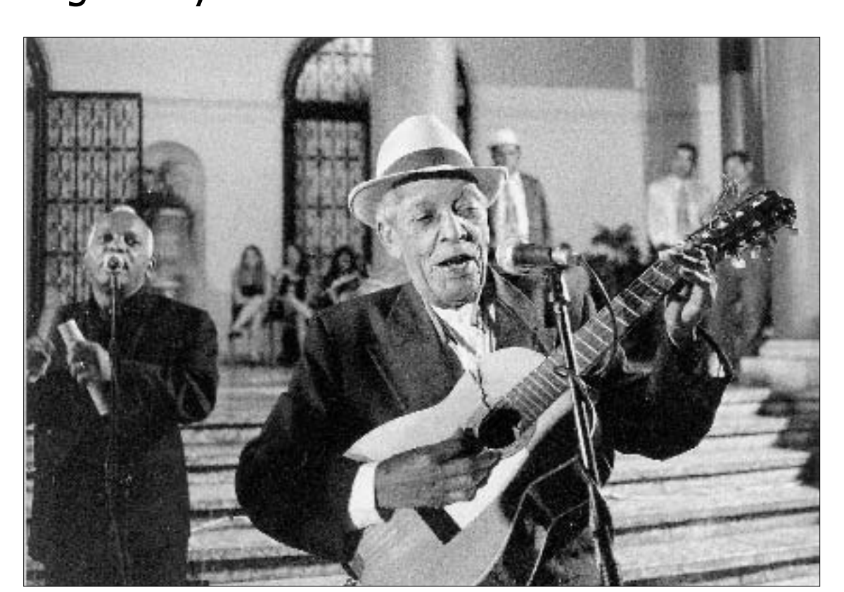
Compay Segundo in Havana.