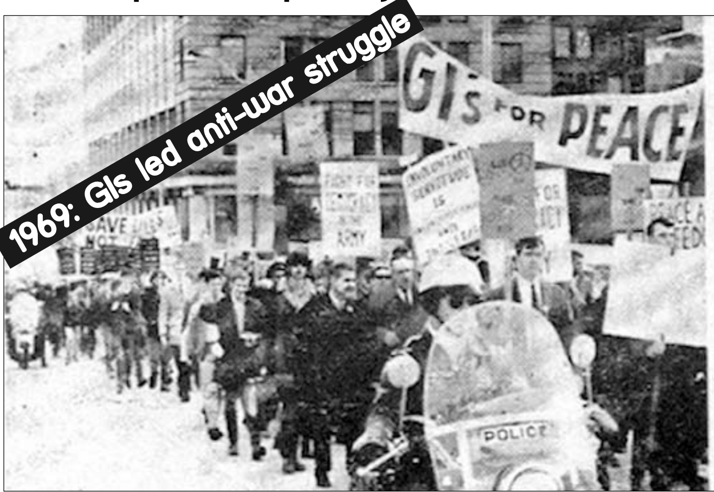
200 GIs from nearby bases led this anti-war march in Seattle on Feb. 16, 1969.