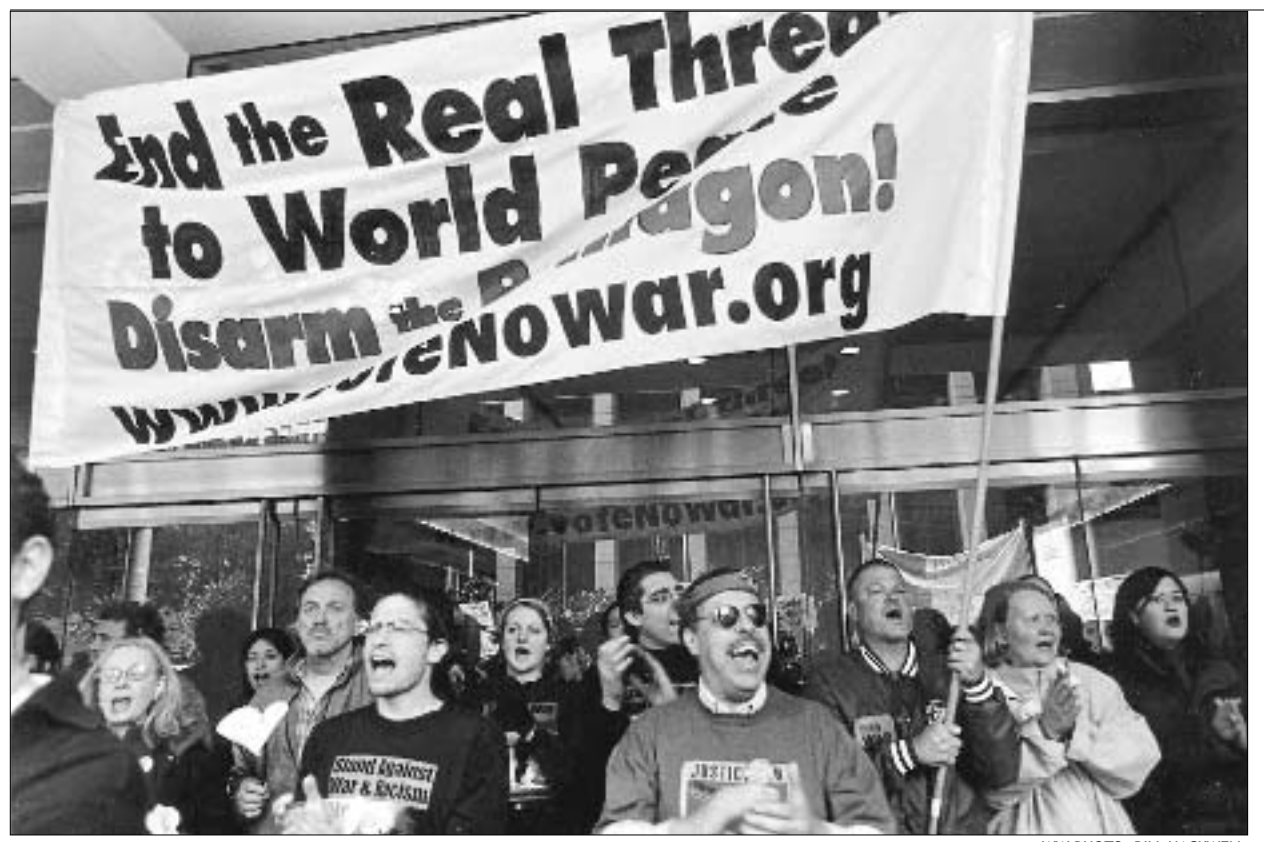
ANSWER blocks entrance to Bechtel, San Francisco, March 20. The city was shut down and 1,600 protesters were arrested.