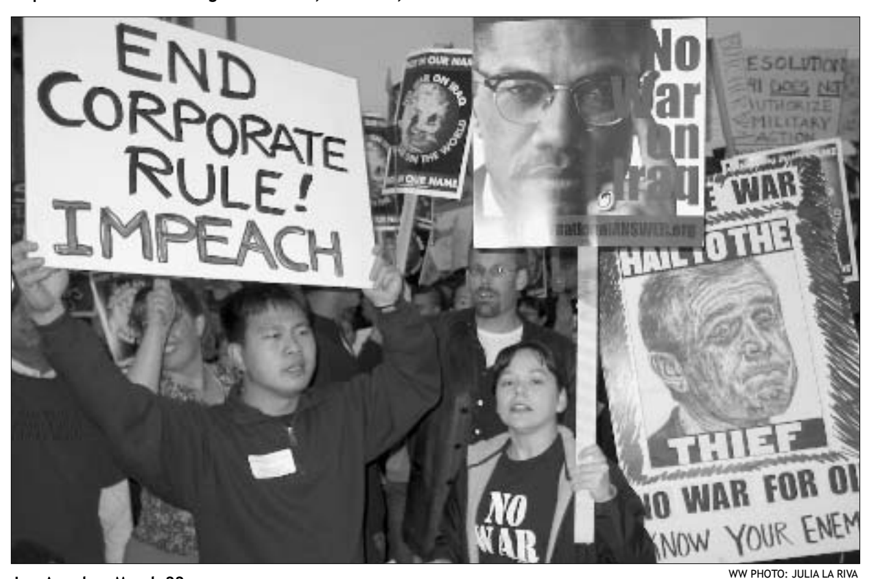
Los Angeles, March 22.

Atlanta P.O. Box 424, Atlanta, Ga. 30301