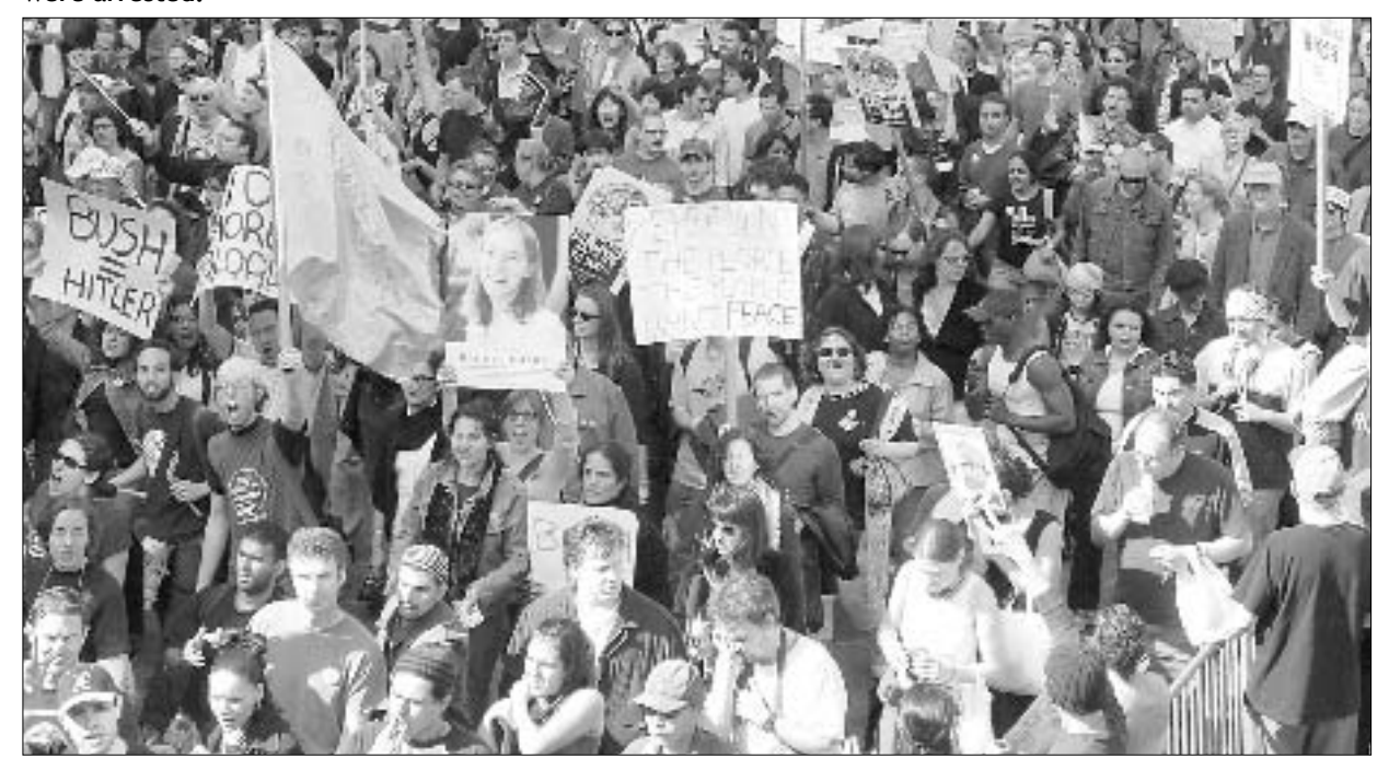
A quarter-million march against the war, New York, March 22.