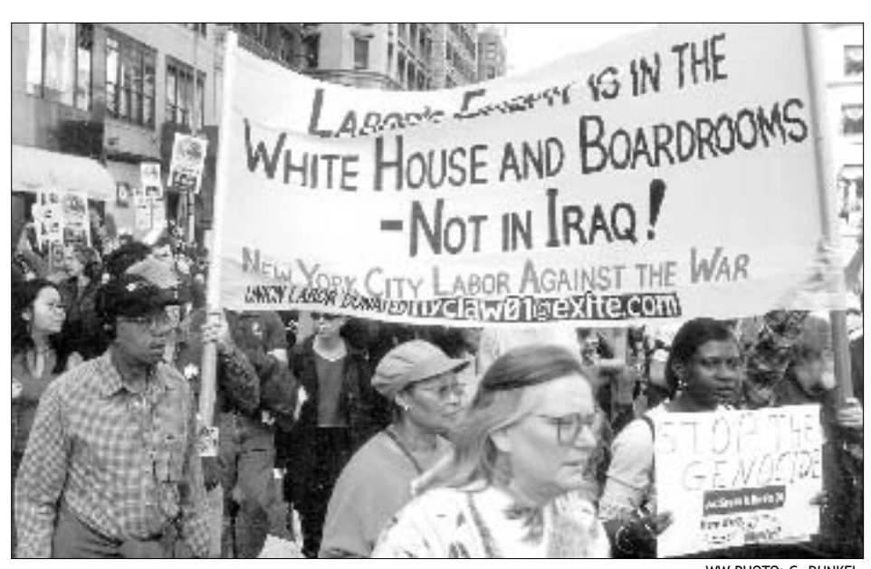
New York City Labor Against the War, March 22. Banner reads, "Labor's enemy is in the White House and the boardrooms.'

History has confirmed over and over that all profound social change comes from below-from the workers and the oppressed nationalities. It is only from their sacrifices that new and creative forms of struggle will develop to end this barbaric system of wars and recessions.