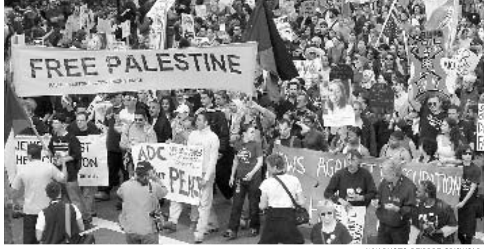
New York, March 22.

Other areas organizing ongoing antiwar protests include Buffalo; New Paltz and 60 other towns and villages in Mid-Hudson Valley, N.Y.; Houston and Austin, Texas; Detroit and Lansing, Mich.; Hartford, Conn.; Boston; Baltimore; and many more cities.